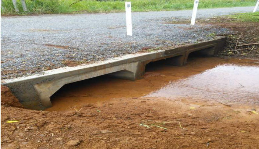
(Above) Ironbark road Culvert Extension