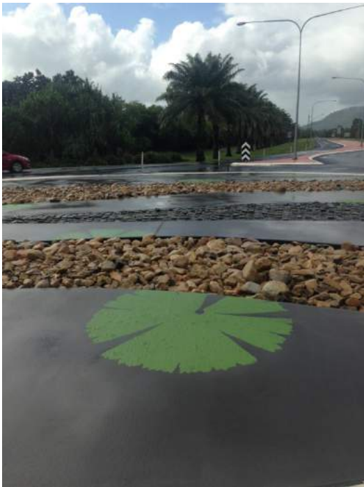
Port Douglas roundabout landscape project

This month saw the completion of hardscape works on the Port Douglas roundabout landscaping project. A few minor finishing touches will still occur to satisfy the Department of Transport and Main Roads requirements in the next week. The team also upgraded the aesthetics of the Port Douglas Habitat roundabout by complementing the site with understory plantings and fresh mulch. These improvements have lifted the landscaping standard on the roundabouts into Port Douglas.