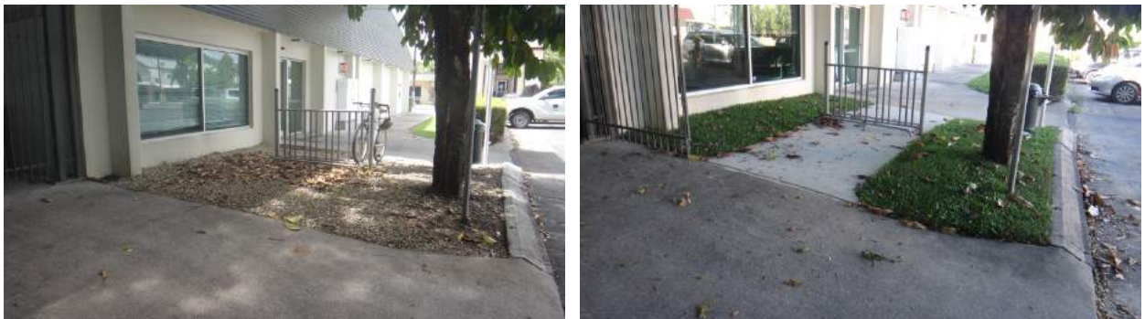
(Above) Mossman Library Garden before and after.

Recent works completed include the garden at the front of the Mossman Library which involved removing loose rocks and installing a grassed and concrete area.