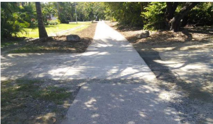
(Above) Davidson Street Footpath Renewal