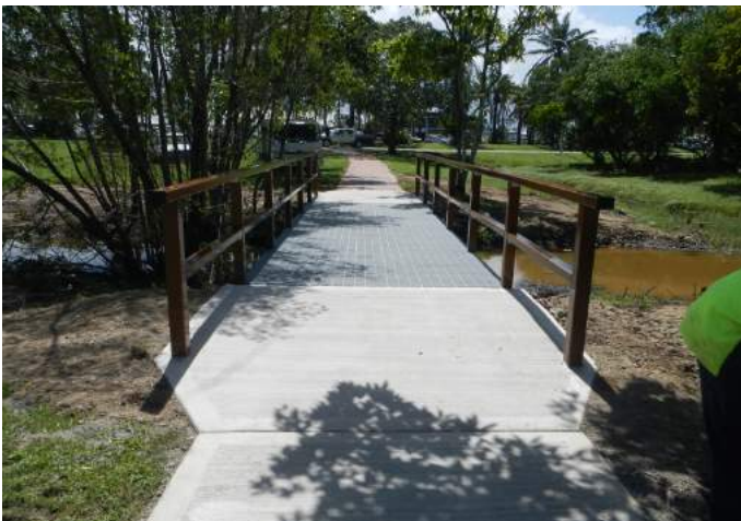
(Above) Grant Street – Port Douglas Footbridge Replacement

Capital works projects over the past two months have included footpath renewal in Davidson Street – Port Douglas, extensions to culverts in Ironbark Road and culvert replacement in Nicole Close.