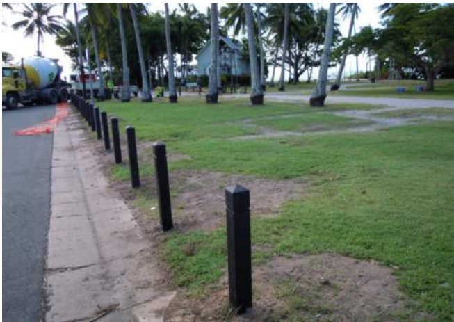
(Above) New bollards Port Douglas