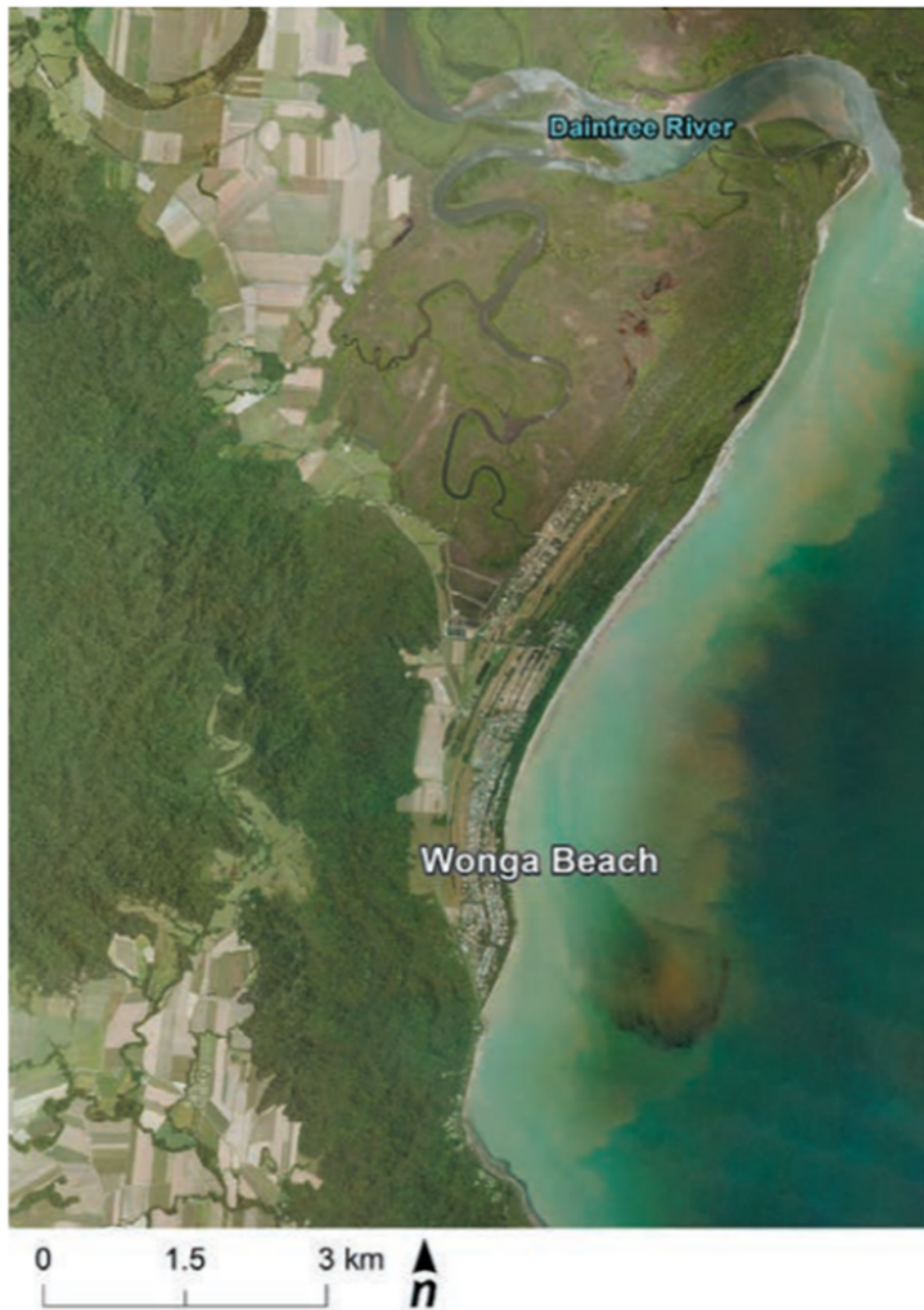
Figure 12. Locality map – Wonga Beach. 18