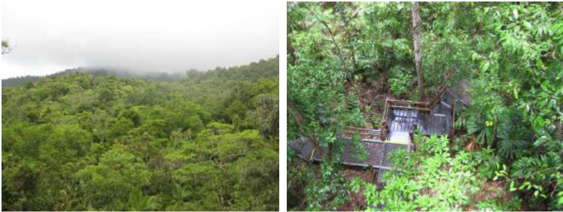
Views of rainforest canopy from tower viewing platforms