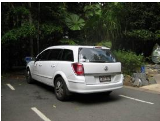
Accessible car park

If arriving by accessible bus or coach, there is a drop-off point at the entry to the ramped pathway.