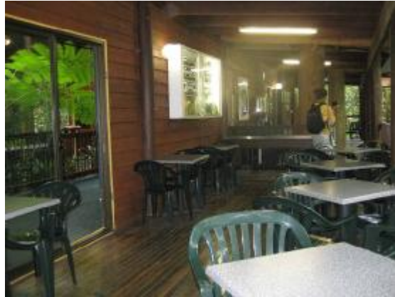
Rest area at the Interpretive Centre