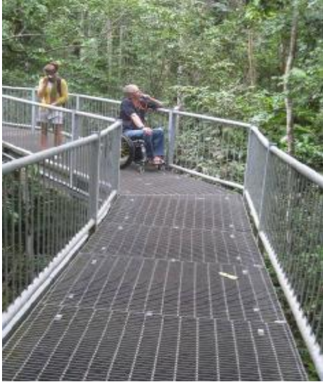
Using audio guide to learn about the rainforest