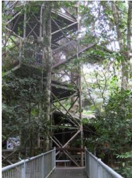
Viewing platforms of the tower above the walkway