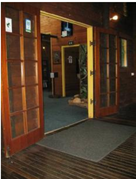
Accessible entry into Interpretive Centre