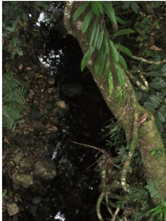
Meandering creeks below the walkway, you may see a cassowary wander through