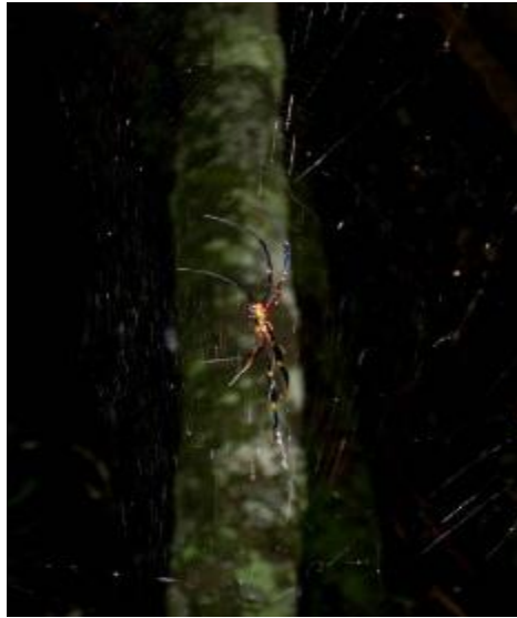
Golden Orb Weaver Spider