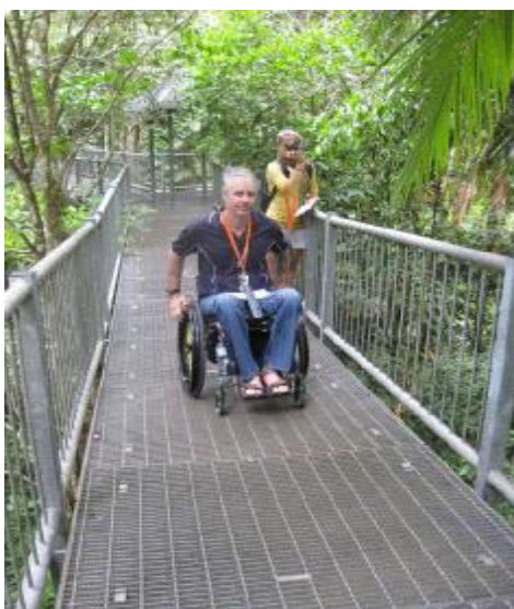
Negotiating gentle gradients