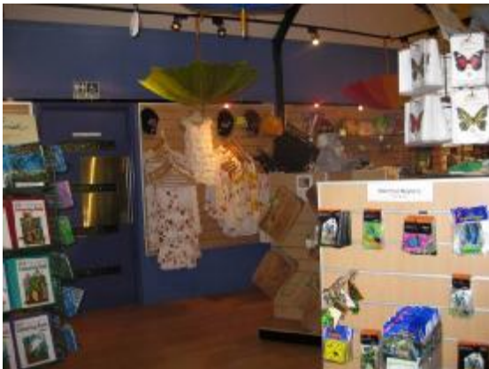
Access through shop area to toilet facilities

The accessible toilet is located adjacent to the ticket office. Note there is no accessible toilet located at the Interpretive Centre.