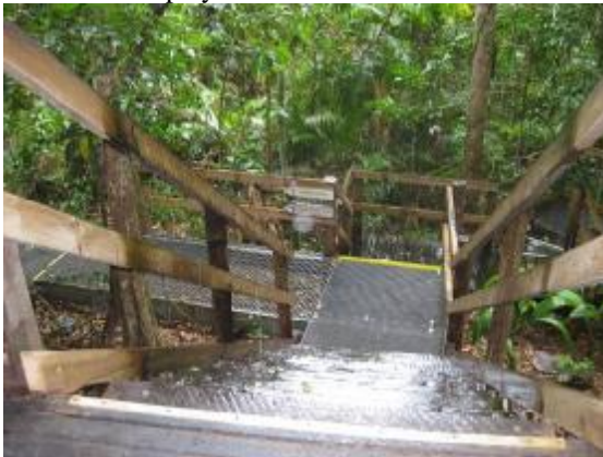
Stairway leading down to lower boardwalks (no access for wheelchairs)