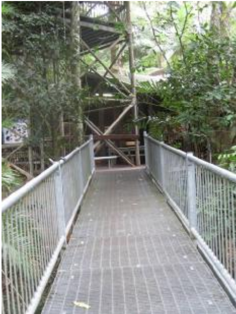
Tower and Interpretive Centre