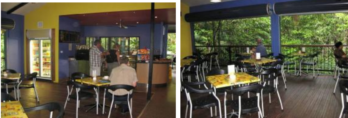
Café and dining areas overlooking the rainforest

The souvenir shop stocks a range of products including locally made jewellery, hand crafted pottery, eco-style clothing, rainforest reference books, children's story books and rainforest souvenirs.