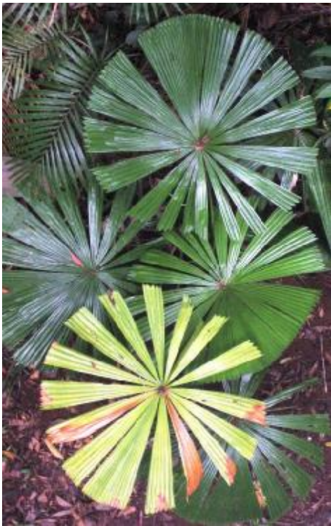
Fan Palms ( Licuala ramsayi )