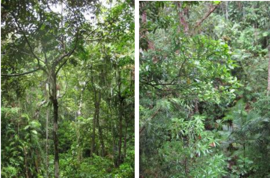
Views of the rainforest canopy from tower viewing platforms