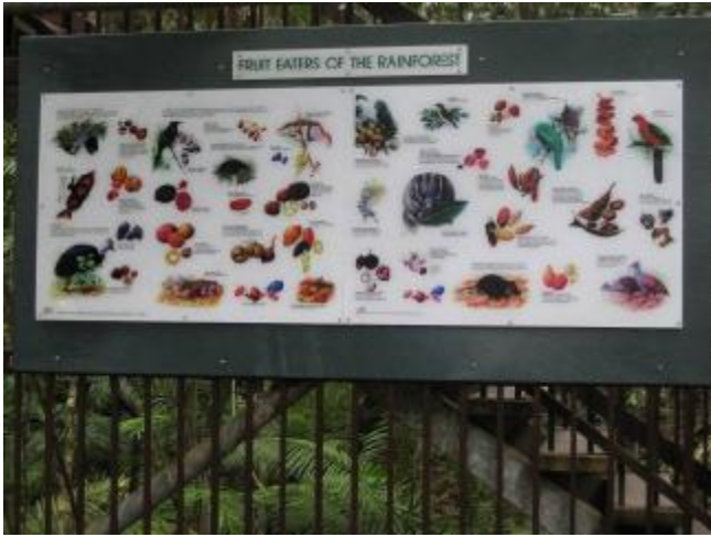
Information boards located under tower platforms