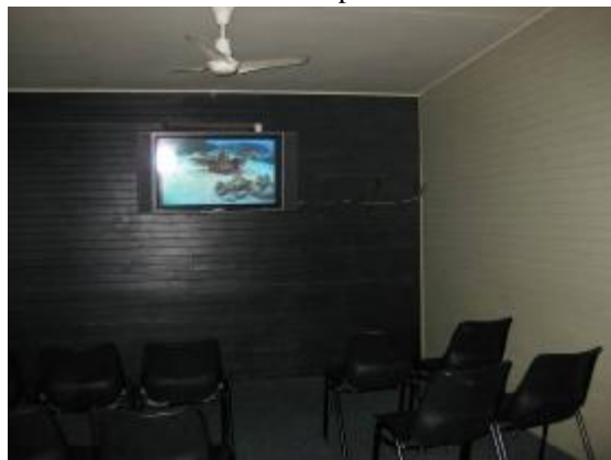
Interpretive Centre cinema