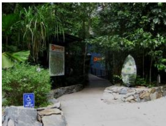
Pathway from carpark to entry ramp