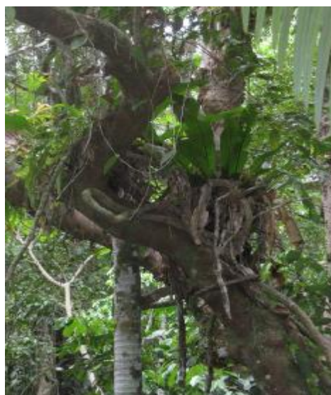
Ornate rainforest plants