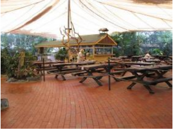
Breakfast with the birds and Lunch with the Lorikeets are other popular attractions held in the park and are must dos.