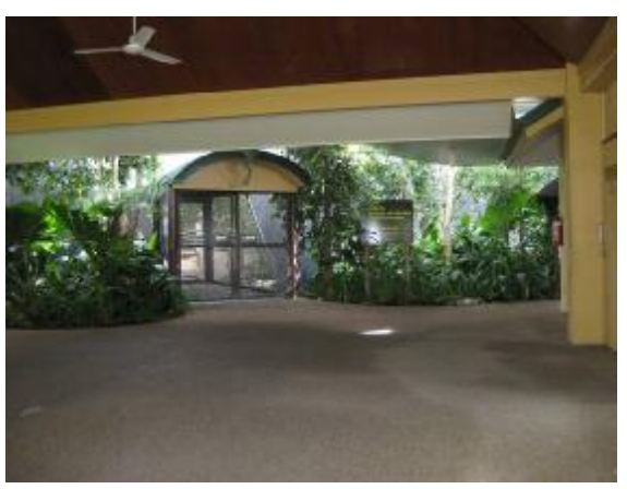
Entry into the Wetlands

The Wetlands paths are made up of concrete paths and boardwalks, in some areas the gradients are a bit steep and assistance from a carer may be needed to negotiate the park. The paths and boardwalks are wide and there is ample room for large mobility devices to manoeuvre freely. The boardwalks have small gaps between the planking making the ride smooth and comfortable and will prevent small front casters from getting stuck.