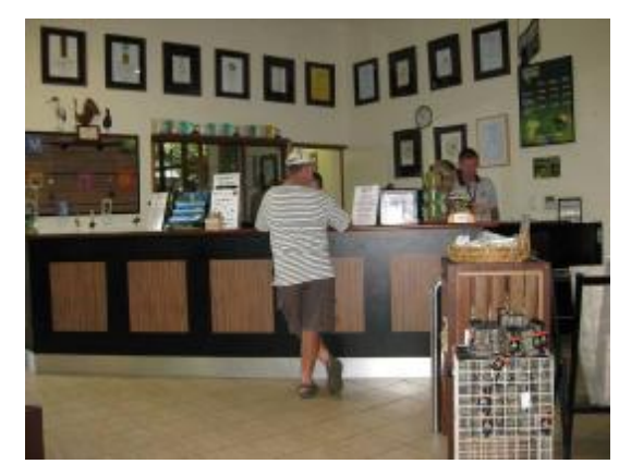
Main entry in the Rainforest Habitat