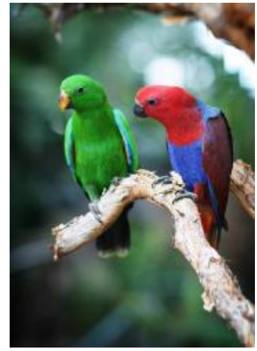
Meet the inhabitants of the Wetlands