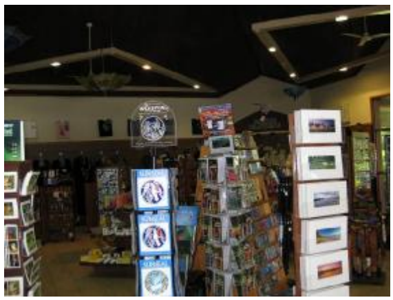
The souvenir shop