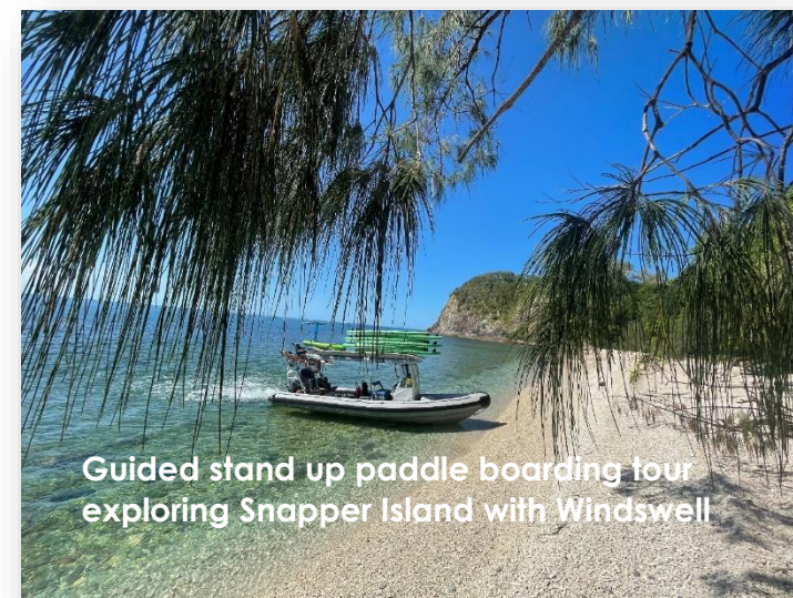
Guided stand up paddle boarding tour exploring Snapper Island with Windswell

If you do not have your own transport to Snapper Island which is accessible only by boat, WindSwell can do high speed boat transfers Ex Port Douglas to and from Snapper Island and then drop offs along the Daintree coast to your chosen accommodation or tour company. Bookings can be made by calling Brett on 0427 498 042 or emailing windswellkitesurfing@gmail.com .