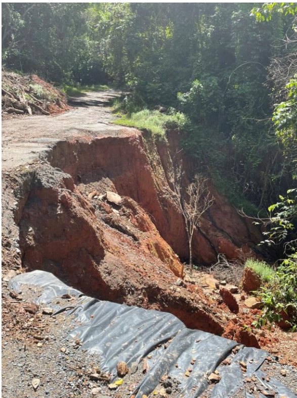
Site 18 progress