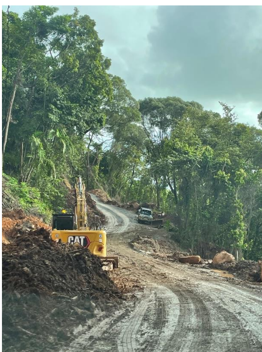
Cape Tribulation Bloomfield Road

The Department of Transport has produced detailed maps showing all the repair sites along the length of Cape Tribulation Bloomfield Road. They may be viewed or downloaded here: https://douglas.qld.gov.au/download/community_engagement/Cape-Tribulation-Road-and-Cape-Tribulation-Bloomfield-Road-Repair-Sites.pdf