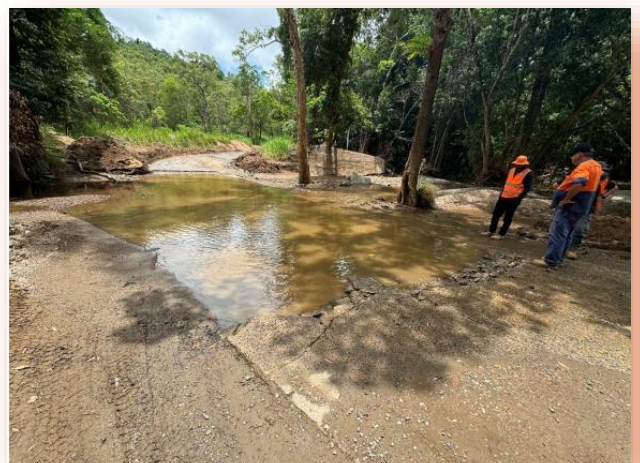
Example of major creeks and culvert damage including Gap Creek, Platypus Creek, and Olufsen Creek.