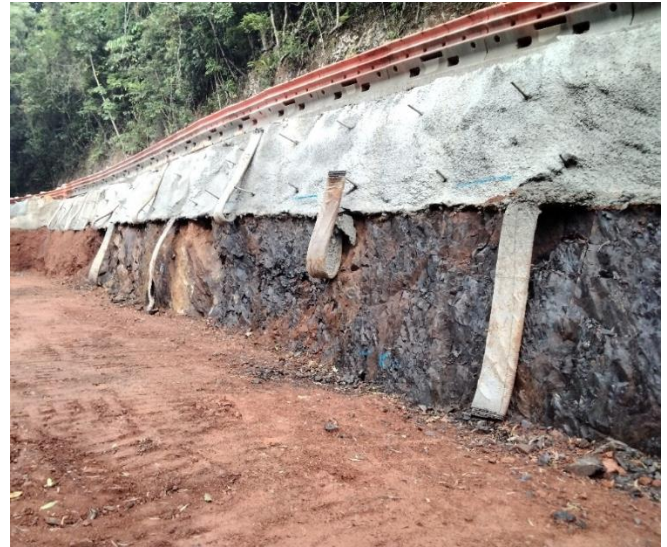
Alexandra Range Repairs – above and below.