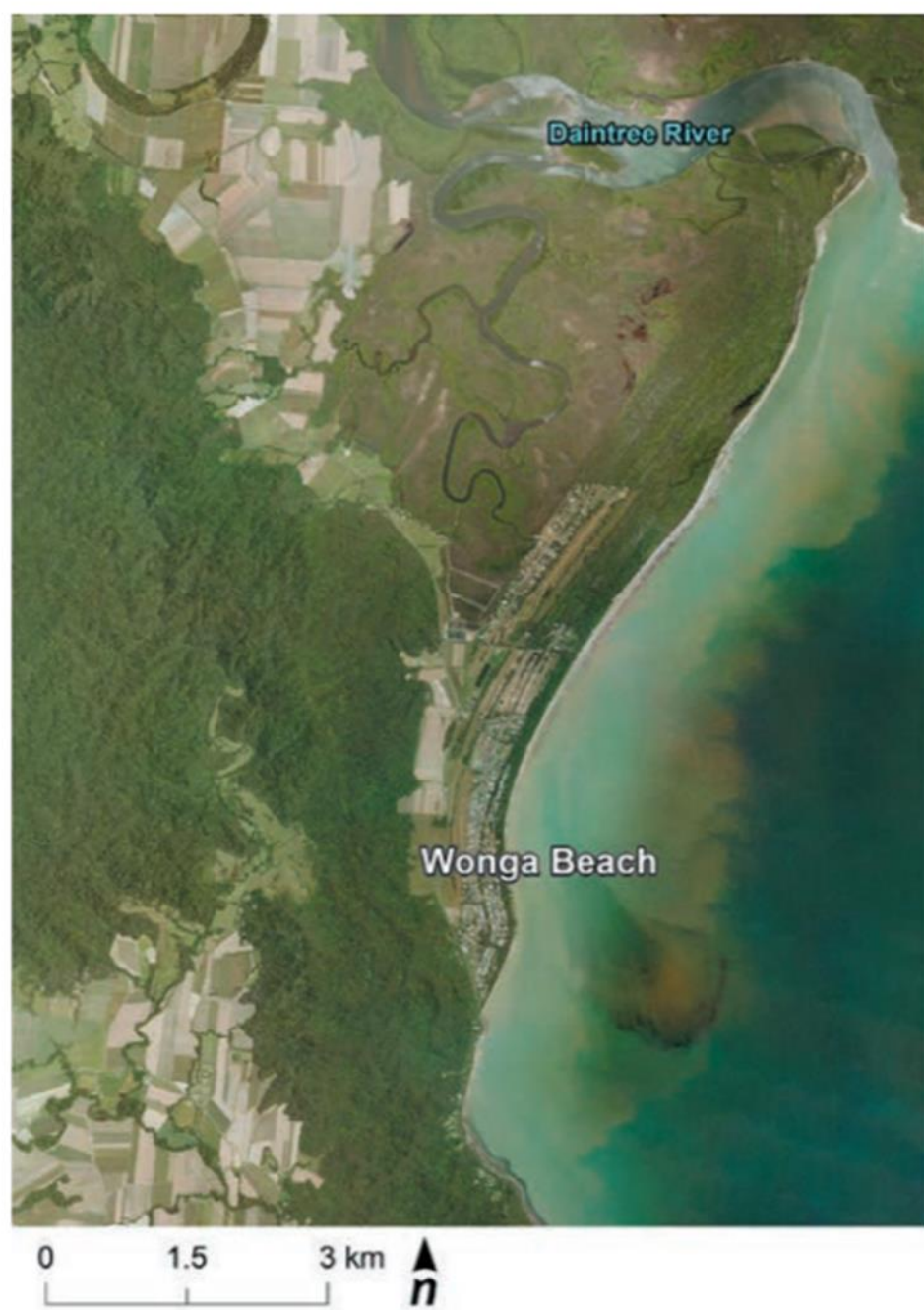
Figure 12. Locality map – Wonga Beach. 18