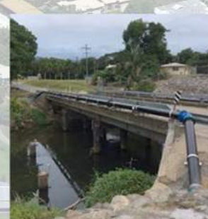
The damage to Junction Bridge and the trunk water main was repaired during this month.