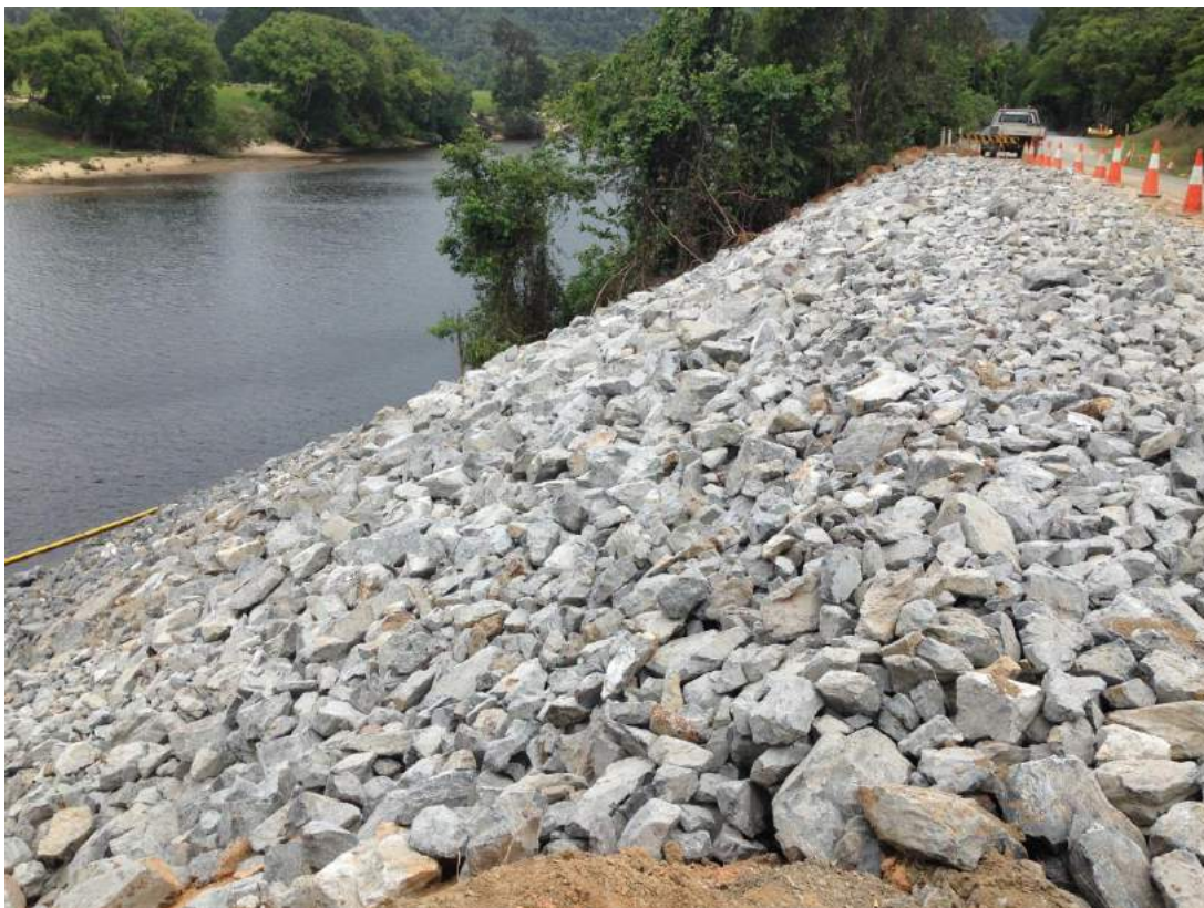
Completed work on landslip #4 Upper Daintree Road