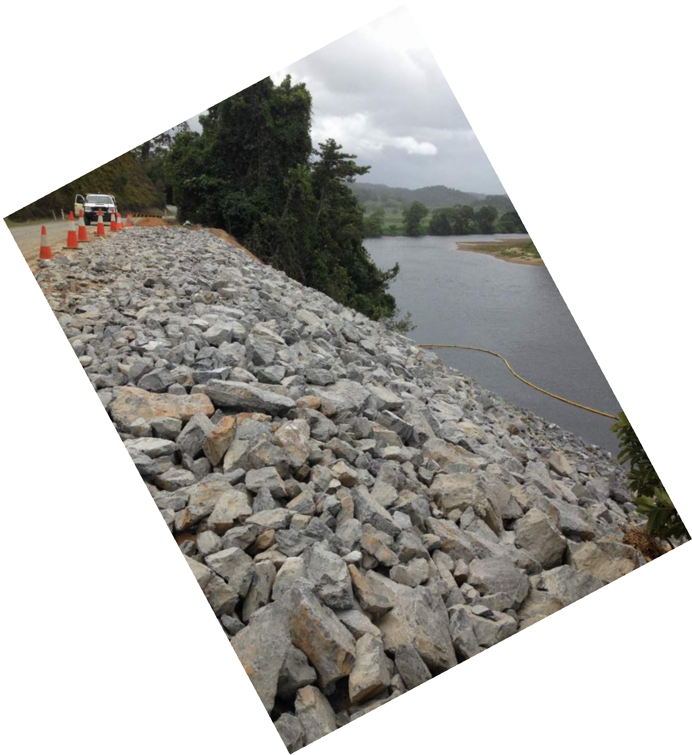
Completed work on landslip #5 Upper Daintree Road