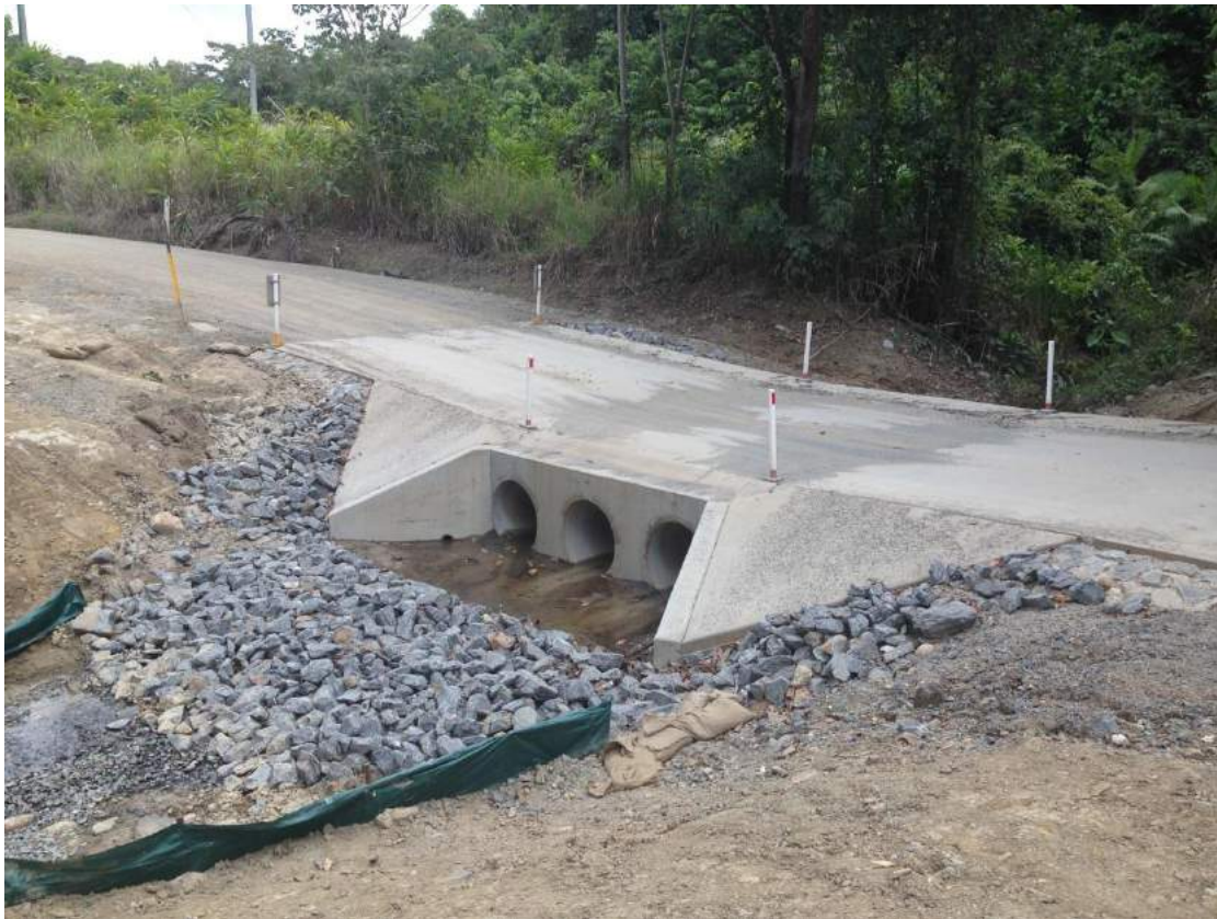
Completed culvert on Whyanbeel Road