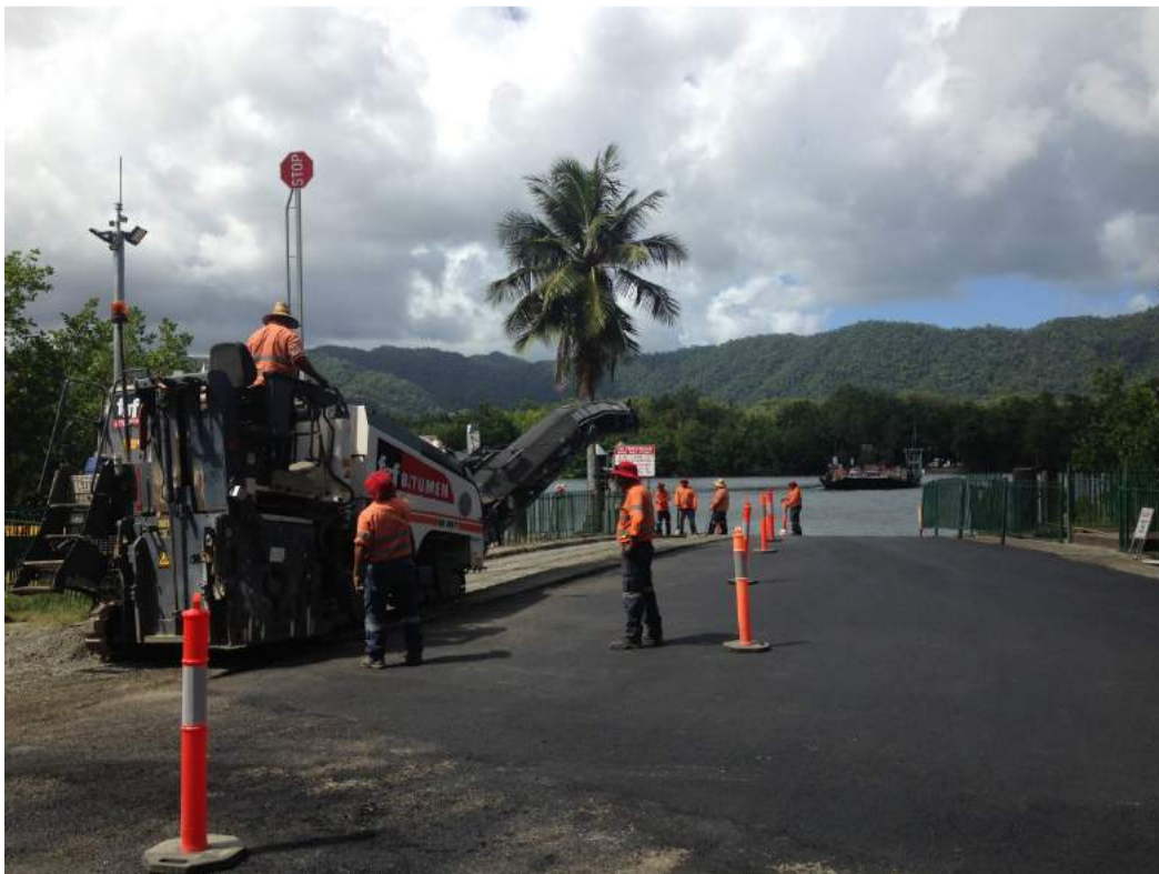
Asphalt works Cape Tribulation Road – southern bank of ferry.