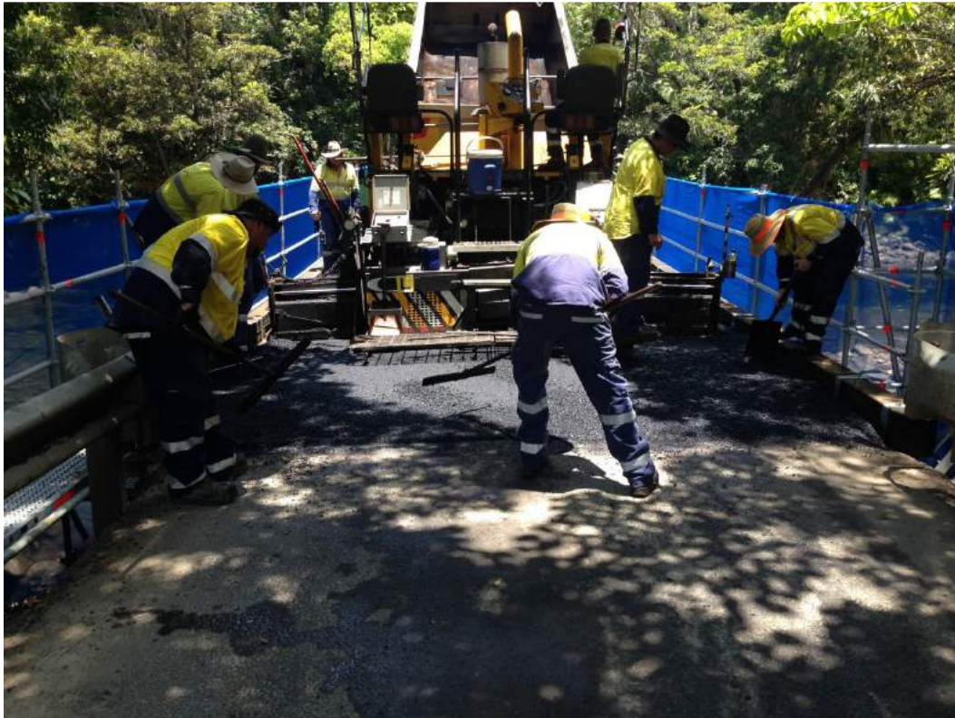
Asphalt works Noahs Bridge