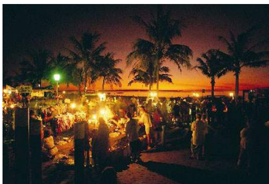
Mindil Sunset Market, Darwin