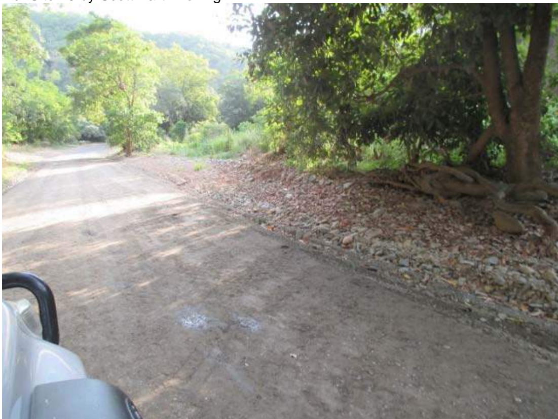
Contract DSCNDRRA010 Completed Works – gravel resheet. Cape Tribulation Bloomfield Rd. Site 23 by Scott Earthmoving