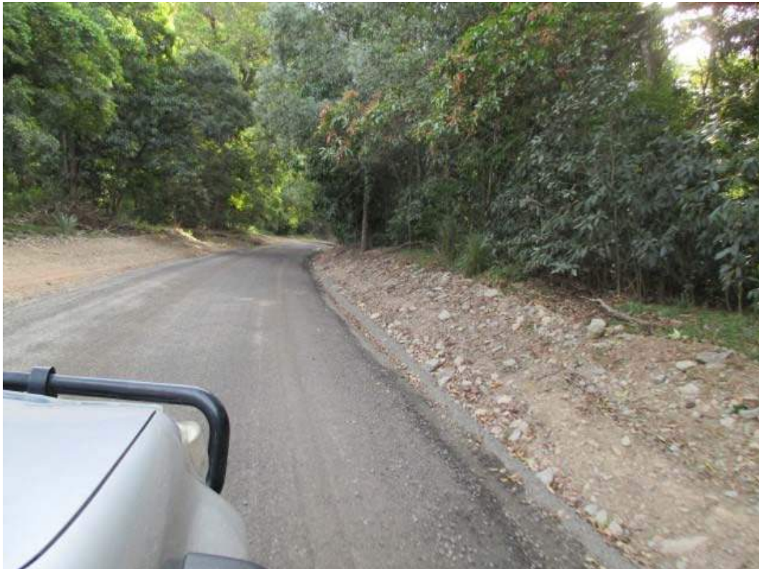
Contract DSCNDRRA010 Completed Works - gravel resheet. Cape Tribulation Bloomfield Rd. Site 19 by Scott Earthmoving