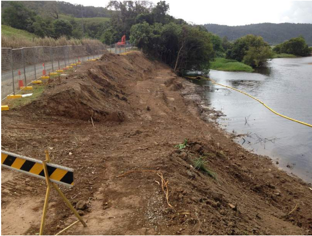
Preparation work on landslip #4 Upper Daintree Road