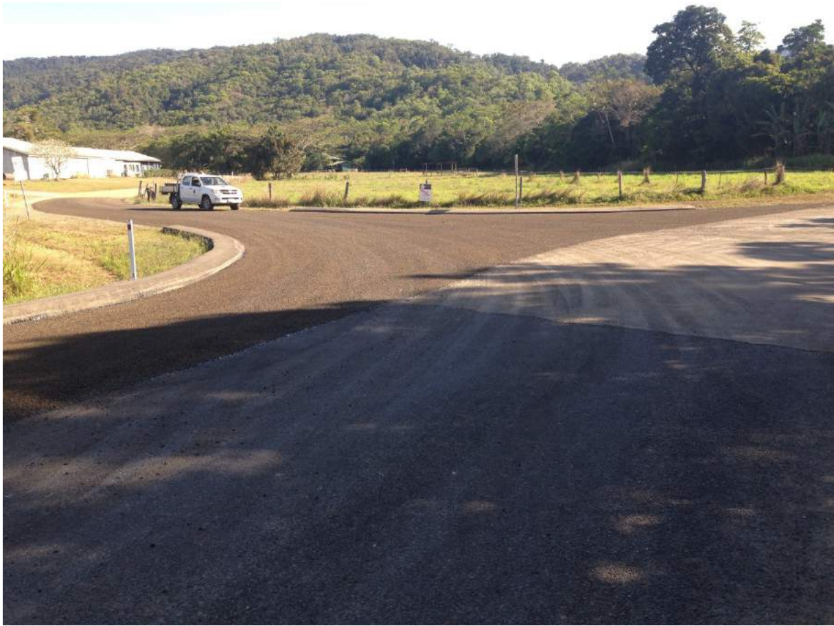
Completed seal Borzi Road