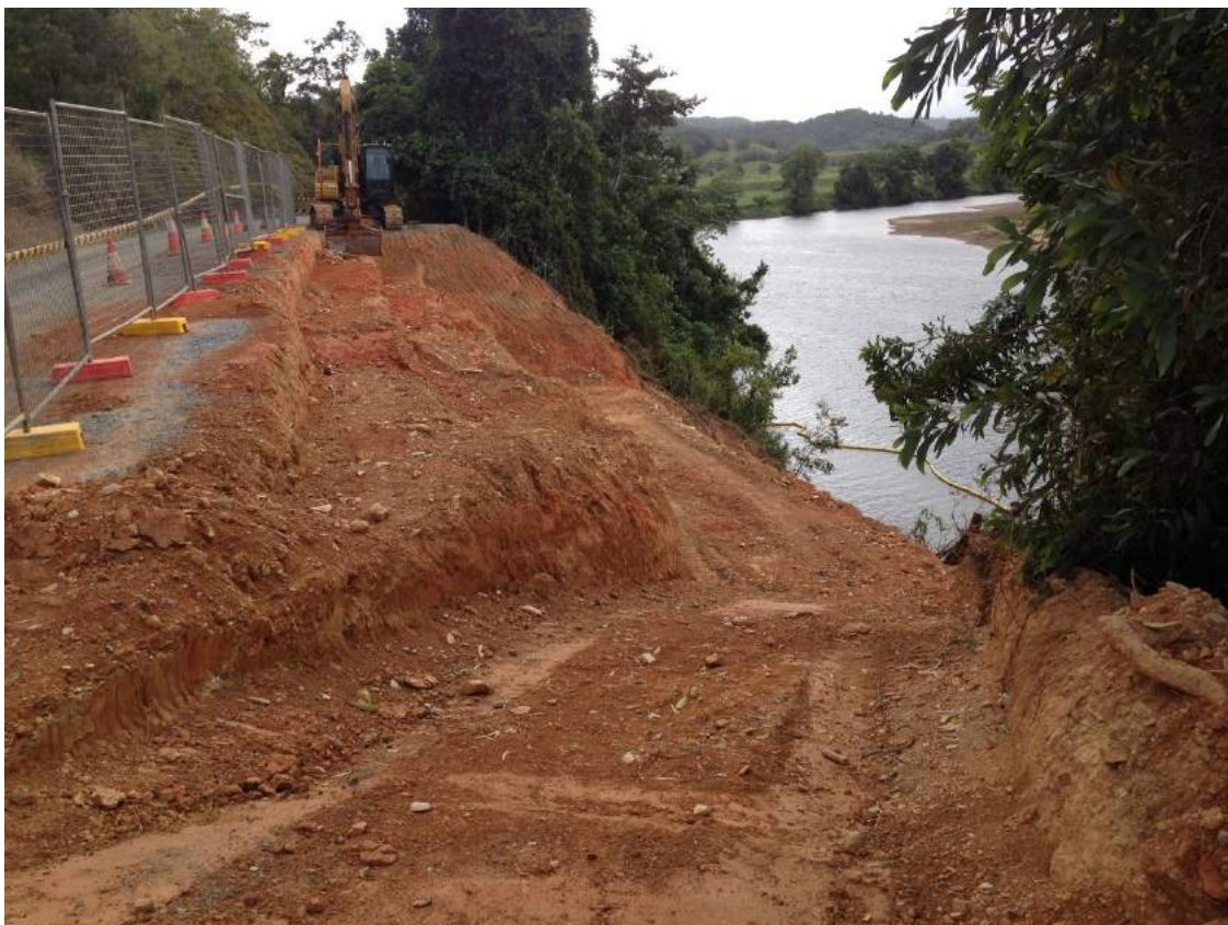
Preparation work on landslip #5 Upper Daintree Road