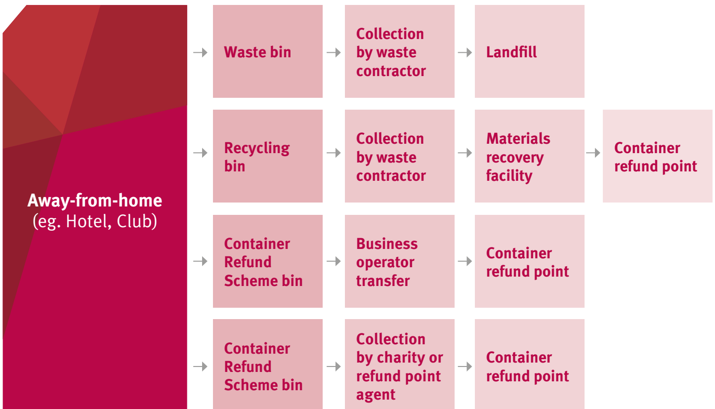
Figure 1. The potential pathways for containers generated at away-from-home locations such as hotels and clubs