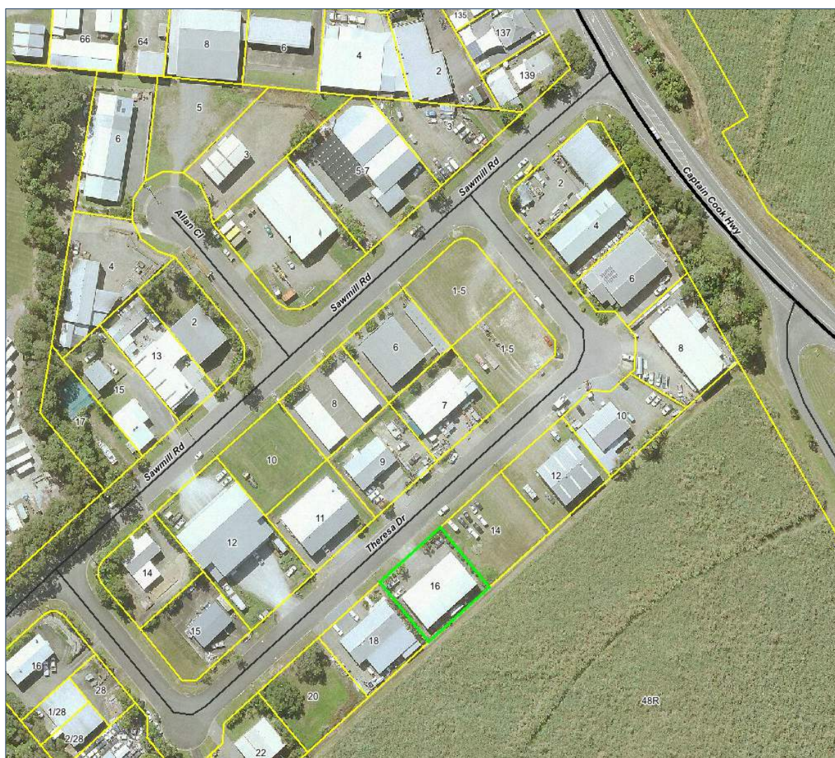
Figure 1. - Locality plan

Under the Planning Scheme the land is included in the Industry Planning Area of the Mossman and Environs Locality. The Scheme includes a Fire Station use within the definition of Public Utilities and Facilities . The use of Public Utilities and Facilities in the Industry Planning Area would normally trigger a material change of use for code assessable development.