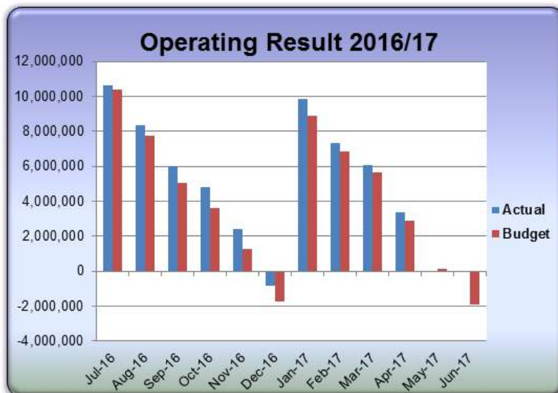
Figure 3. PROPOSAL

As reflected in the attached report, total operating revenue at the end of April was ahead of budget whereas operating expenditure was under budget. This has resulted in an operating surplus of $3.4m compared to a budgeted surplus of $2.9m. As mentioned above however, this result does not include any committals for materials and services.