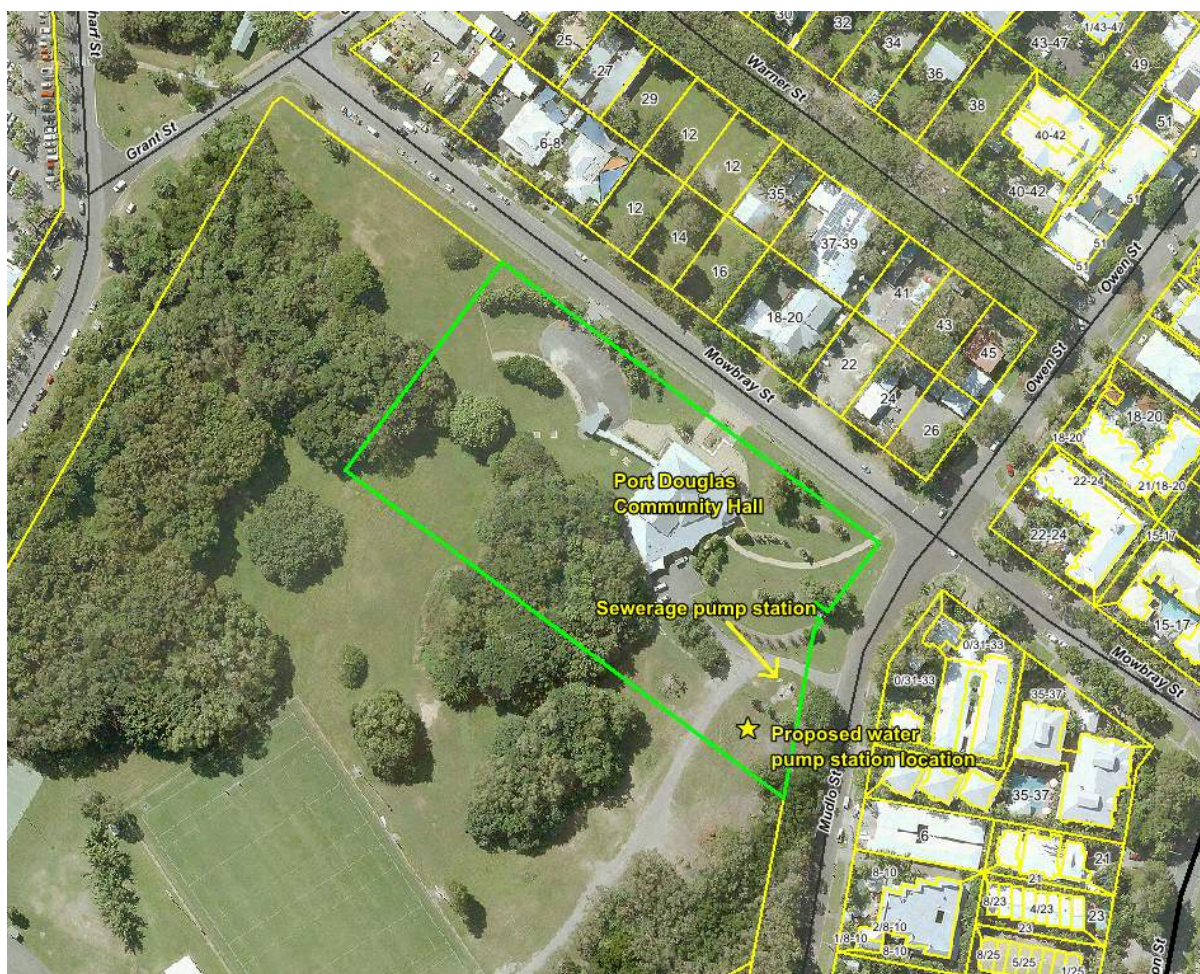
Figure 1 – Locality Plan

This site was selected from several potential sites owned by Council. Factors such as cost, suitability, engineering requirements and community impacts were considered in the final decision to select this site. Locating the pump station at the rear of the reserve (public halls) was considered the most preferred site.