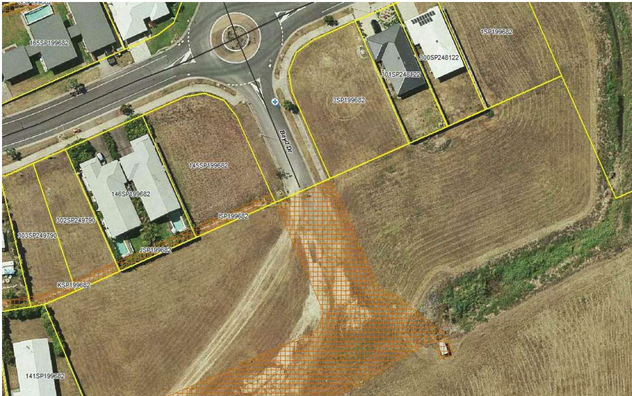
Lot 144 to be located on the western side of the "orange hatched" area

The residential lots being created as part of this proposal are more conducive to accommodate a future House than the previously reconfigured lots fronting Cooya Beach Road given the regular shape of the allotments and the adequate road frontage. This is demonstrated by the house plans attached at Appendix 2.