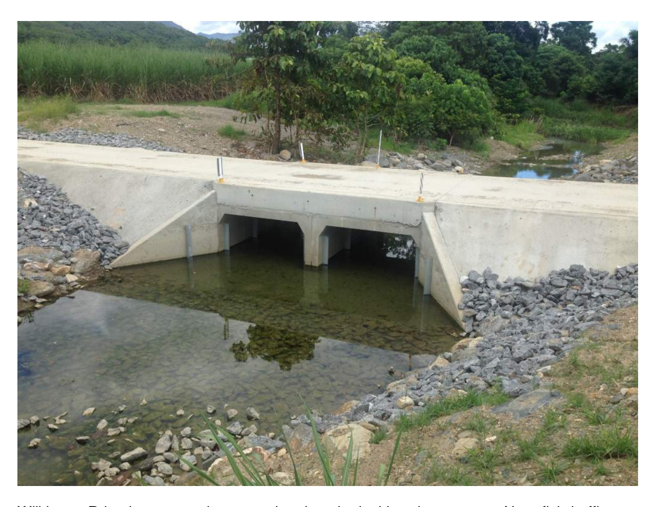
Wilkinson Rd culvert upgrade – completed works looking downstream. Note fish baffles on walls of culvert as per Department of Fisheries requirement