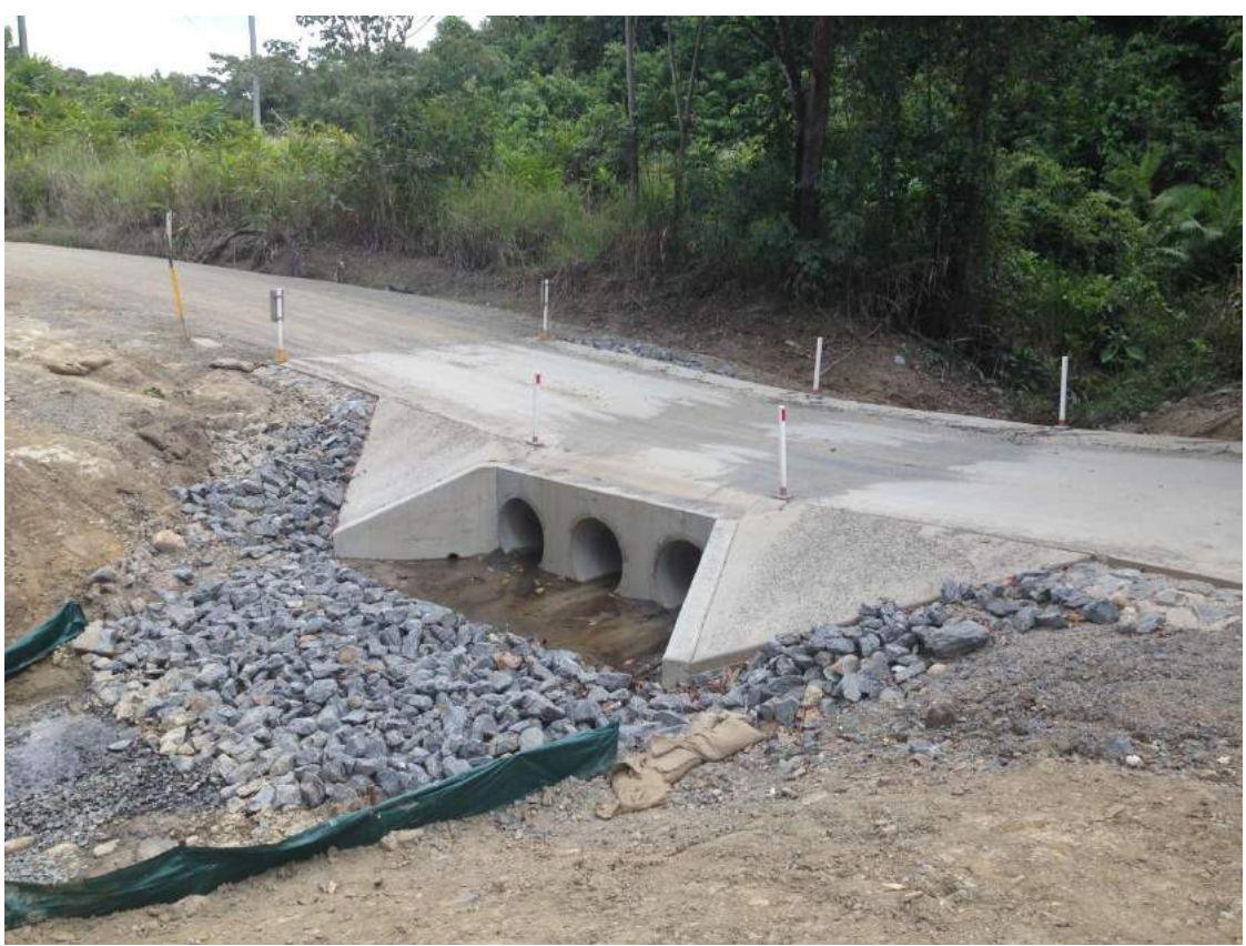
Completed culvert on Whyanbeel Road