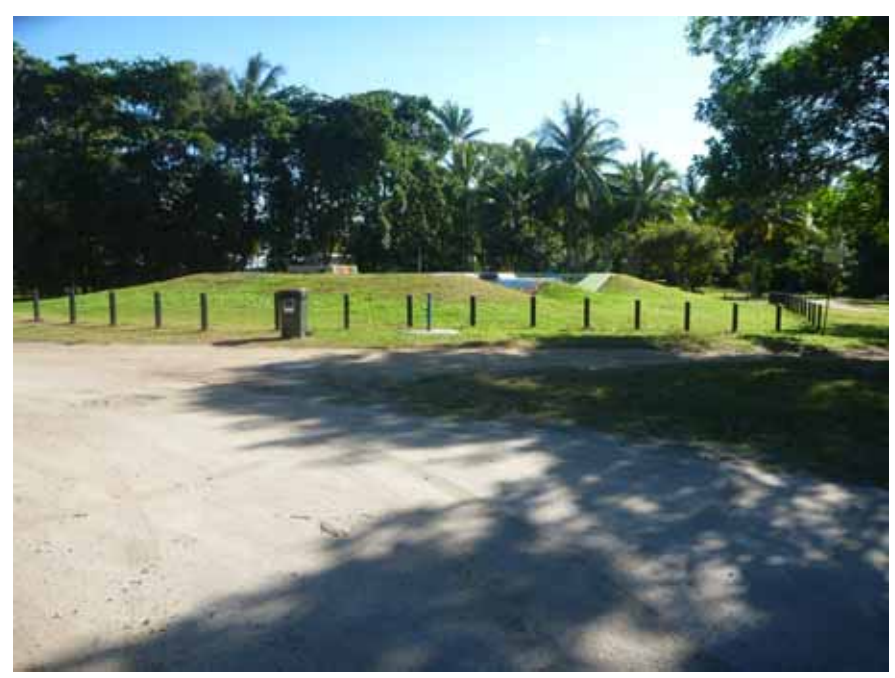
(Above) Bollards at the Wonga Skate Park

The mulching program has commenced and gardens at Newell Beach have been the first completed. The nursery has handed out 909 plants, which included a strong sales component.