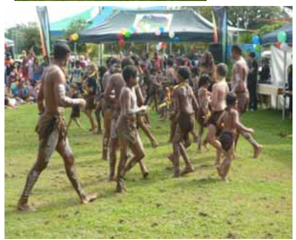
(Above) NAIDOC Week 2015 Events