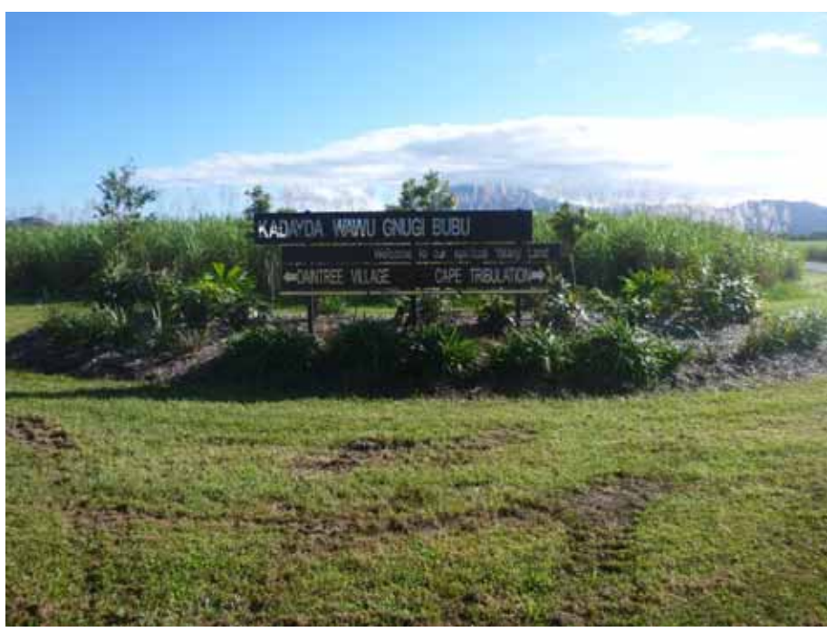
(Above) Daintree gateway signage

The Pest Management crew have been busy reinstating fire break tracks on Butchers Hill which will provide access for future Hiptage control works. This work was funded by Terrain and their ongoing support is appreciated. The crews have conducted 813 man hours on survey and control of declared weeds including 744 hours surveying and controlling 1.5 hectares of Siam Weed. A total of 40 feral pigs were destroyed during this month. The feral pig trapping services contract expired 30 June 2015 and Council has a new position of Pest Animal Controller, which commenced on 6 July 2015.