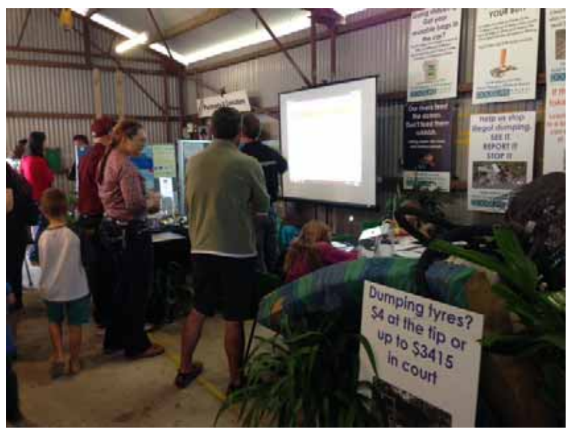
(Above) DSC Mossman Show Stall

Community member keen to take part in a survey regarding rubbish and recycling should follow <a href="https://www.surveymonkey.com/s/JMRWR86">https://www.surveymonkey.com/s/JMRWR86</a>. The information captured in this survey will assist Council in understanding why people dump rubbish, or not recycle correctly, and will help in preparing future communications.