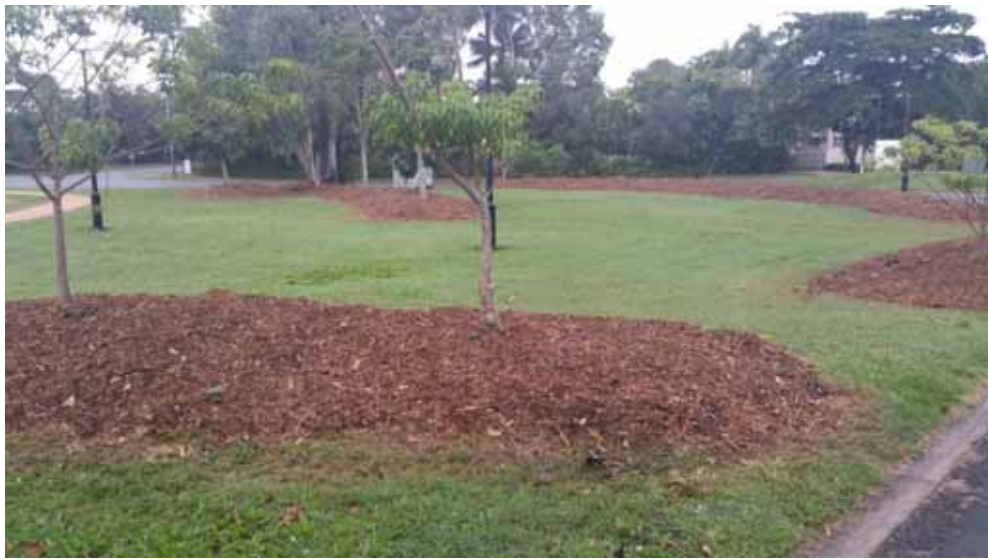
(Above) Upgrades to Community Hall Gardens

Other projects completed over the past few months includes the installation of two (2) picnic tables/benches at Teamsters Park, the replacement of damaged table/benches at the Esplanade, cyclical routine maintenance and the revamp of the old courthouse garden (at the entrance to Rex Smeal Park car park).