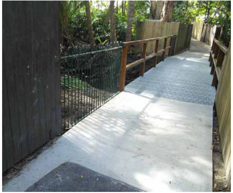
(Above) Sonata Close - upgraded footbridge

Girders and bracing for Fischer's Bridge on the CREB Track have been fabricated and predrilled ready for transport to site. Due to unseasonal rain in June the bridge work was postponed. The CREB Track has now been opened and the bridge crew are set to head off to complete the work over the next four weeks.