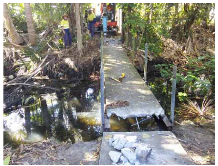
(Above) Sonata Close - existing footbridge