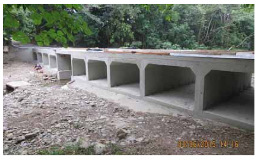
(Above) Spring Creek Causeway: culverts and link slab

The Spring Creek causeway on Mowbray River Road is complete and has been handed to Council. The new causeway is approximately 1.5m above the existing causeway road level and provides improved flood immunity for the local residents. The dry weather helped with the construction program and work was completed ahead of schedule and under budget.