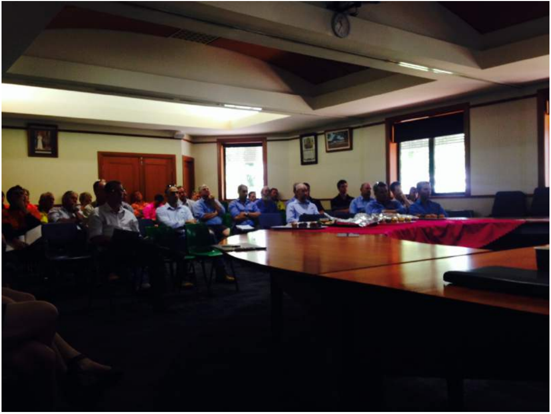
Attendance at tender pre-lodgement meeting