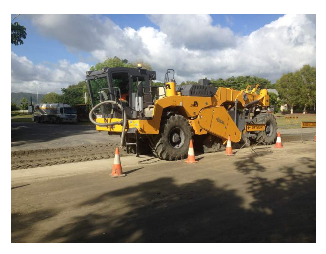
Stabilising works corner Mowbray & Mudlo Streets, Port Douglas