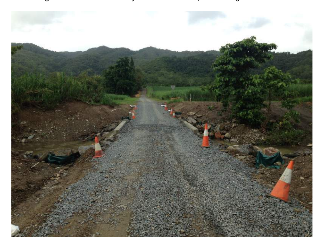
Wilkinson Rd culvert upgrade - temporary access for Christmas shutdown