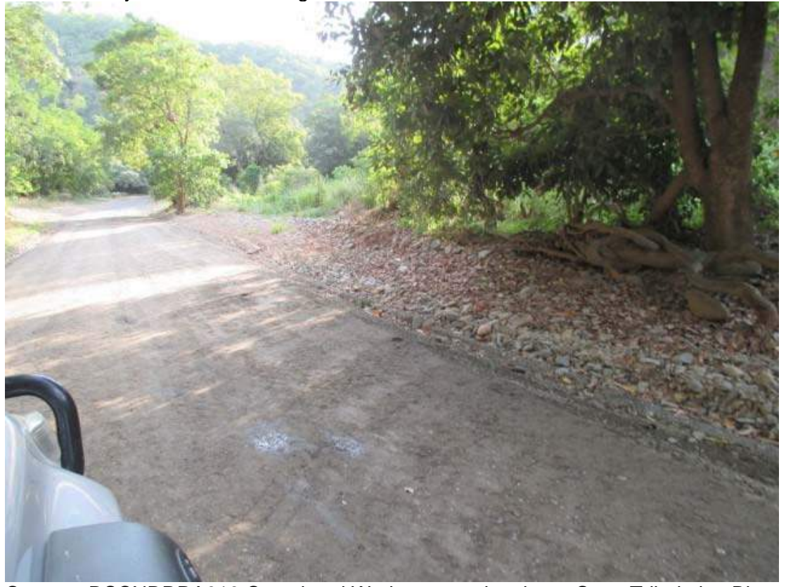
Contract DSCNDRRA010 Completed Works – gravel resheet. Cape Tribulation Bloomfield Rd. Site 23 by Scott Earthmoving