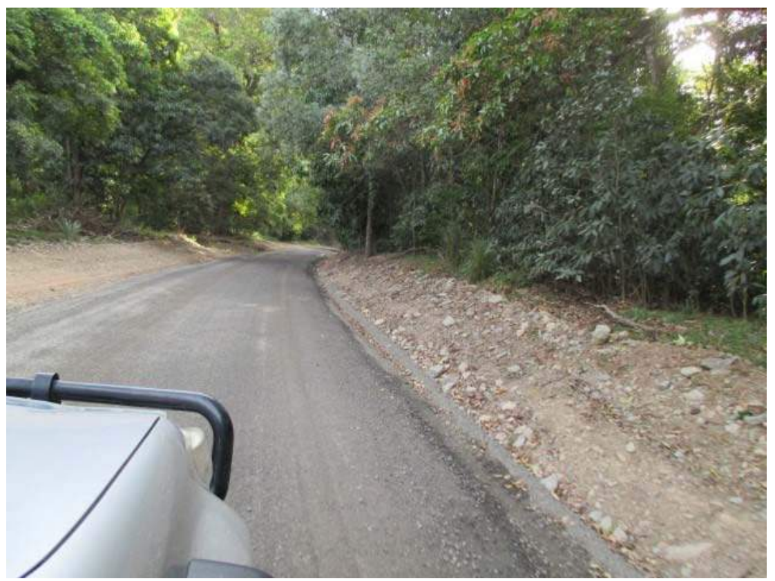
Contract DSCNDRRA010 Completed Works - gravel resheet. Cape Tribulation Bloomfield Rd. Site 19 by Scott Earthmoving