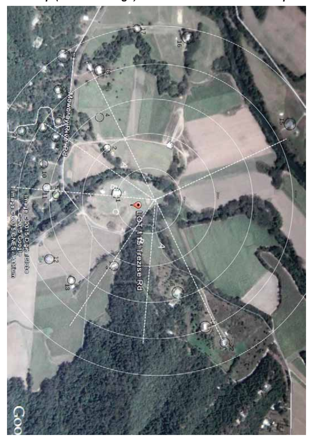
Appendix 2 Map (satellite image) of venue and sensitive receptors