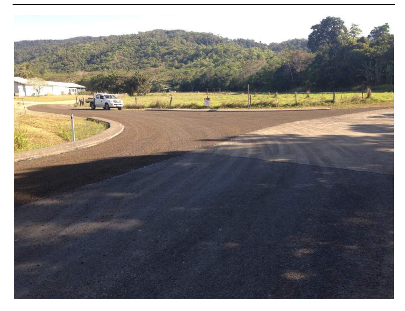
Completed seal Borzi Road