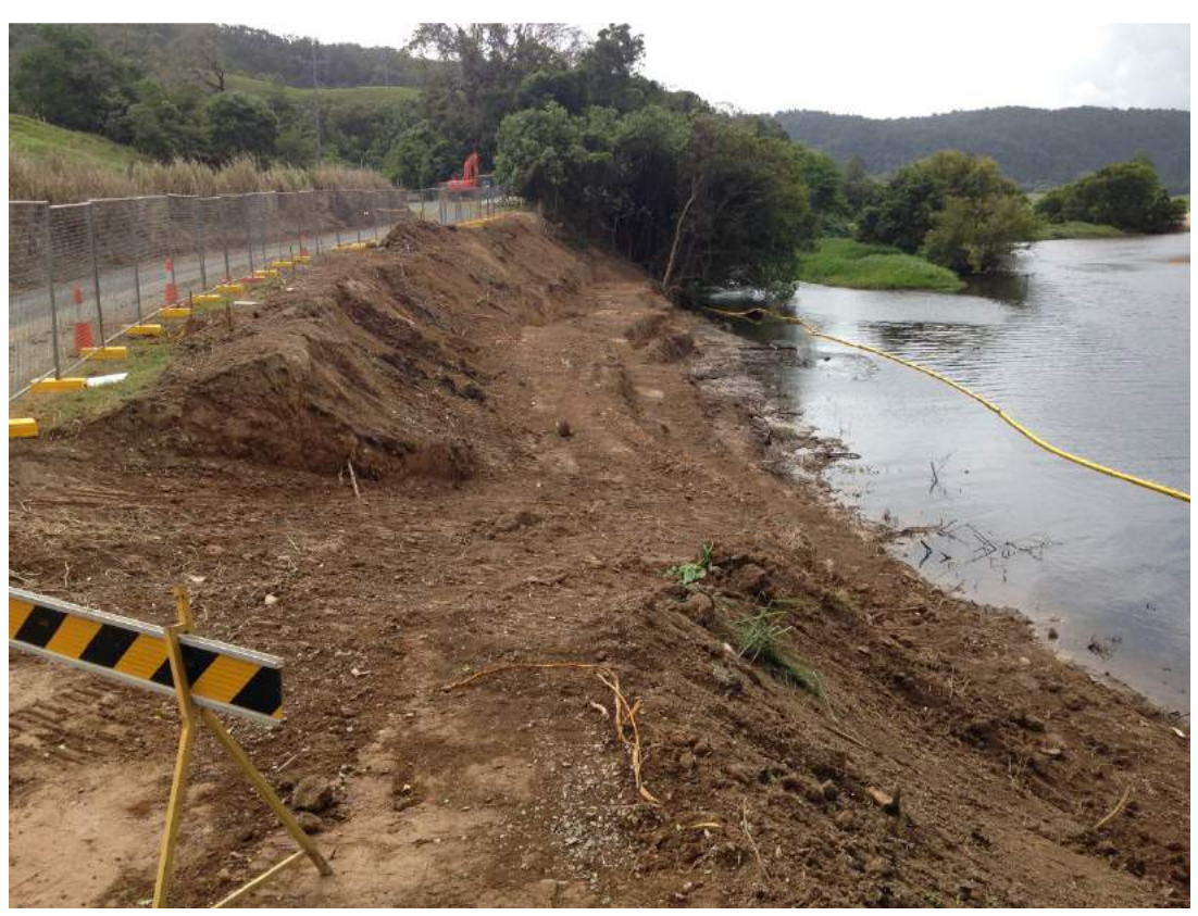
Preparation work on landslip #4 Upper Daintree Road