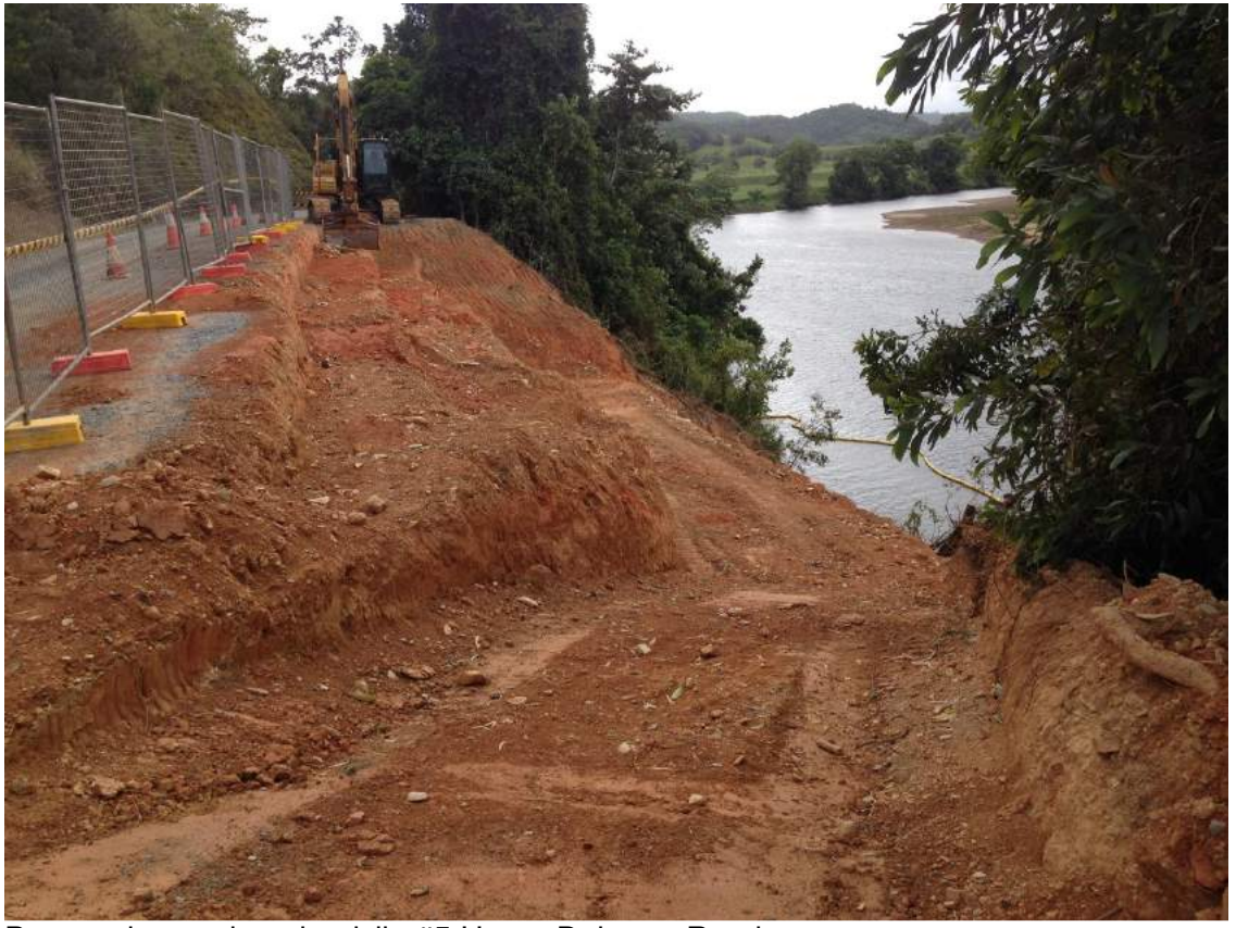
Preparation work on landslip #5 Upper Daintree Road