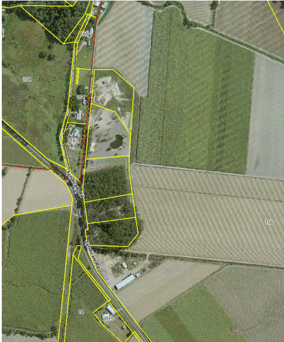
Figure 2. - Cadastral plan with aerial image