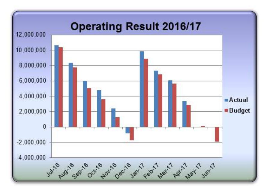
Figure 3. PROPOSAL

As reflected in the attached report, total operating revenue at the end of April was ahead of budget whereas operating expenditure was under budget. This has resulted in an operating surplus of $3.4m compared to a budgeted surplus of $2.9m. As mentioned above however, this result does not include any committals for materials and services.