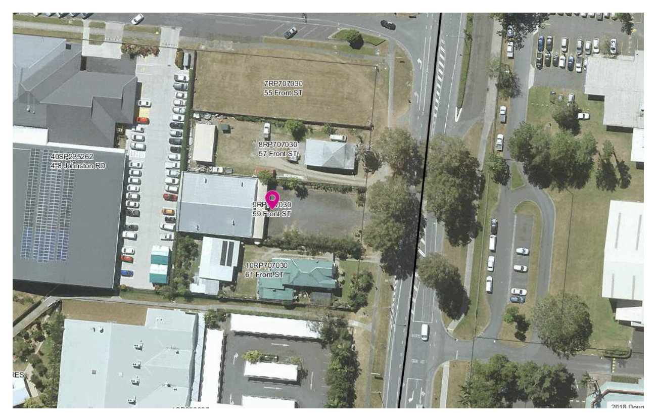
Figure 1 - Locality Plan