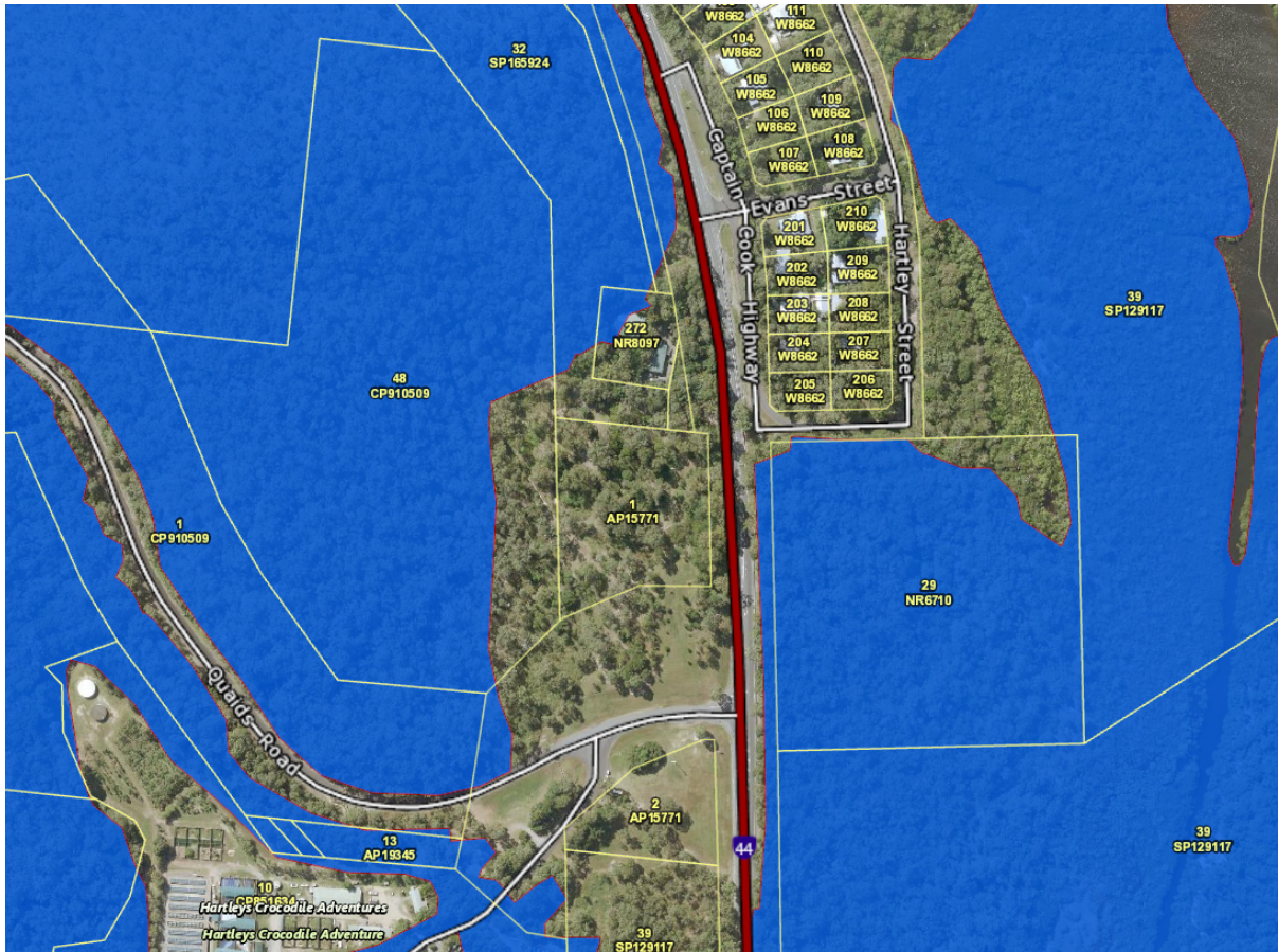
Figure 2. Areas of blue denoting Remnant Vegetation under the Vegetation Management Act 1999