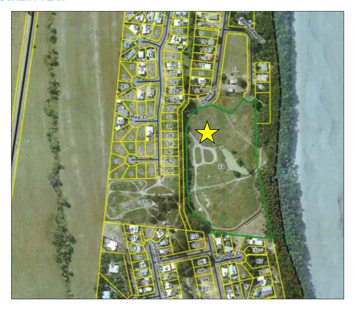
Figure 1 - Locality Plan