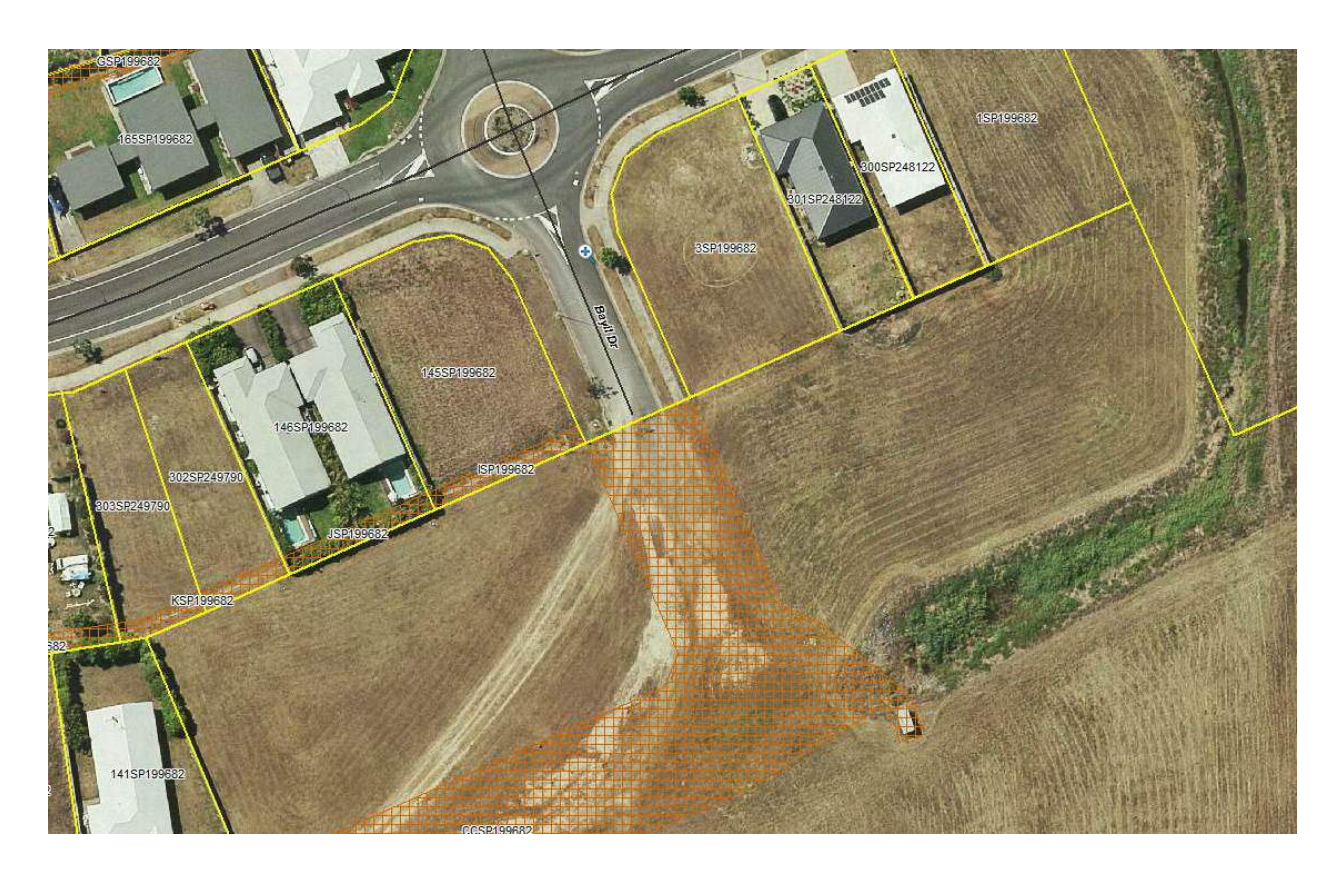
Lot 4 to be located on the eastern side of the "orange hatched" area

The residential lots being created as part of this proposal are more conducive to accommodate a future House than the previously reconfigured lots fronting Cooya Beach Road given the regular shape of the allotments and the adequate road frontage. This is demonstrated by the house plans attached at Appendix 2.