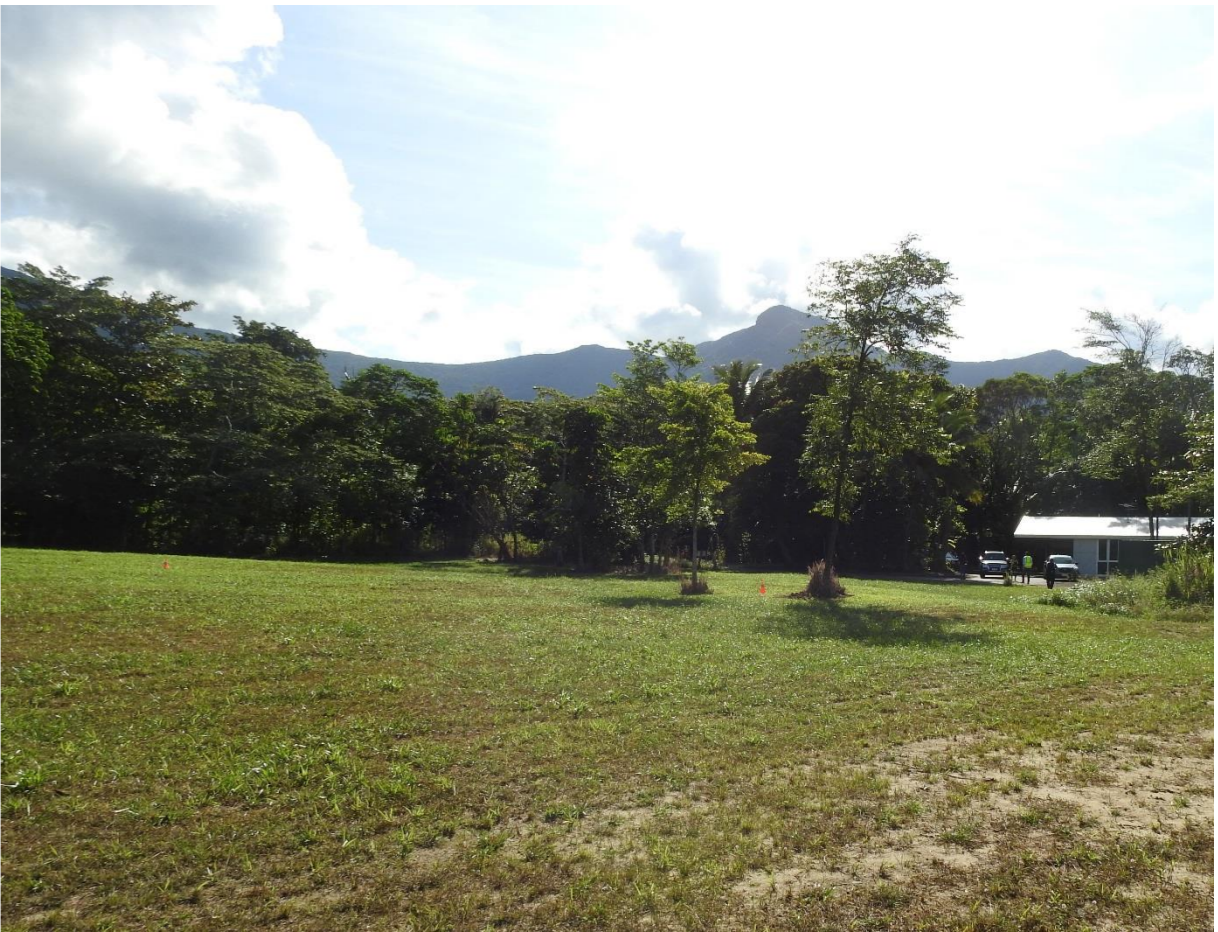
Top left: Aerial image showing the location of the proposed solar array relative to Cape Tribulation Road, the extent of existing screening vegetation and the location from which site-photos were taken.