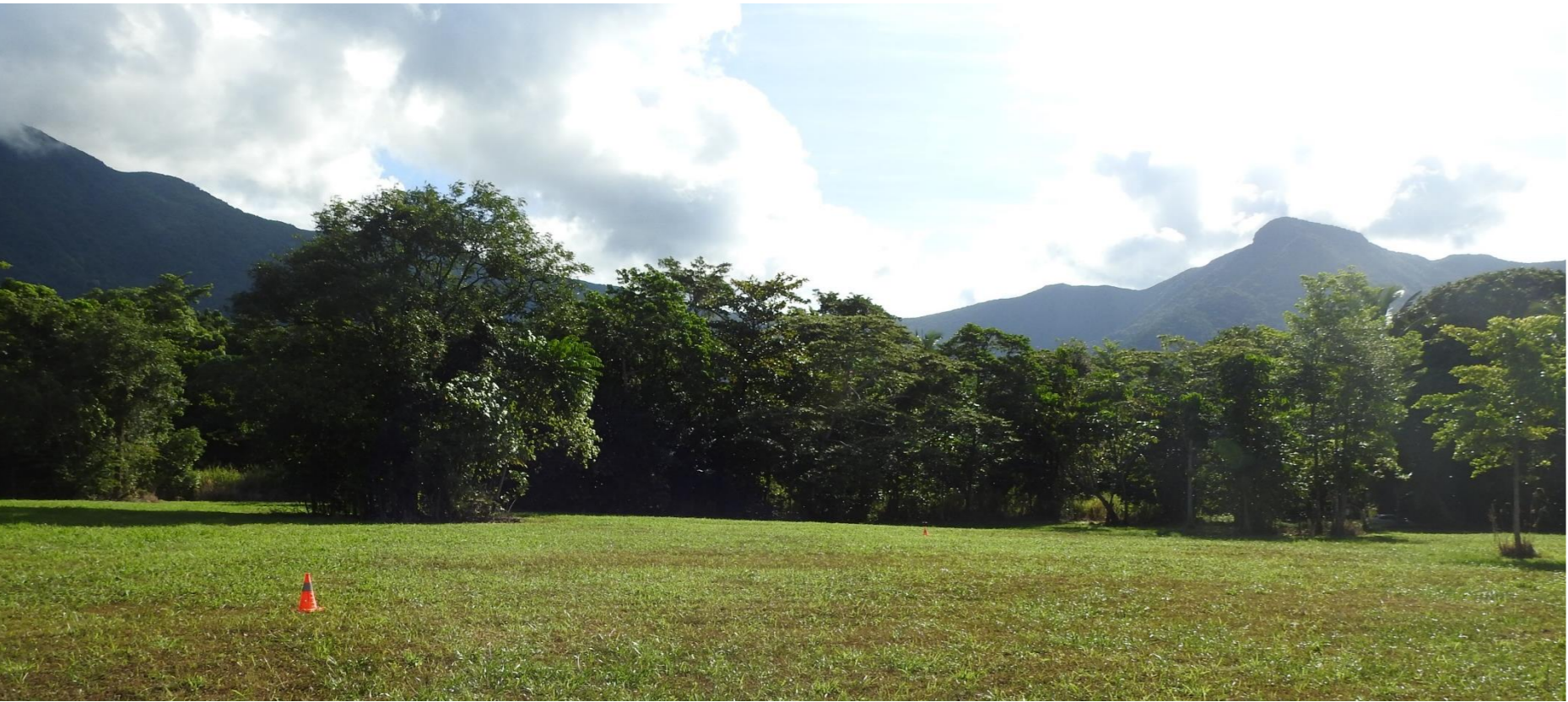
Bottom left: View west directly at existing screening vegetation adjacent to Cape Tribulation Road