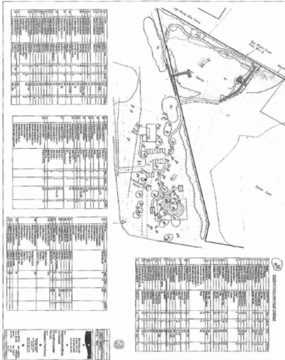
FIGURE 2 – Draft Landscape Plan for proposed Upgrade and extension of Teamsters