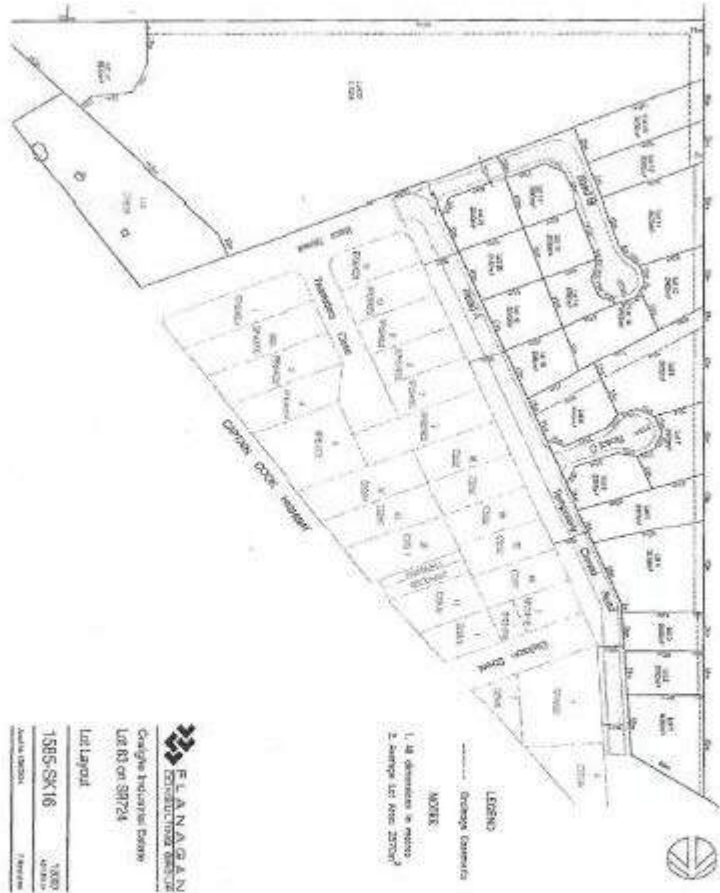
FIGURE 1 Proposed Reconfiguration of Lot 83 on SR724, Owen Street,