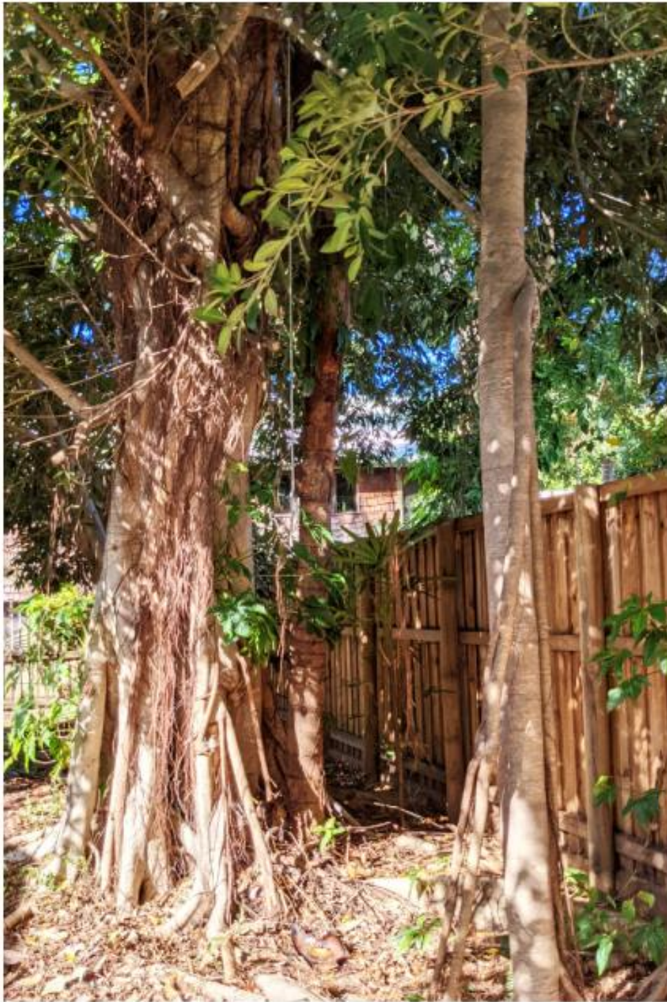
Strangler fig trunk with vertical roots (foreground) and fish-tail palm.