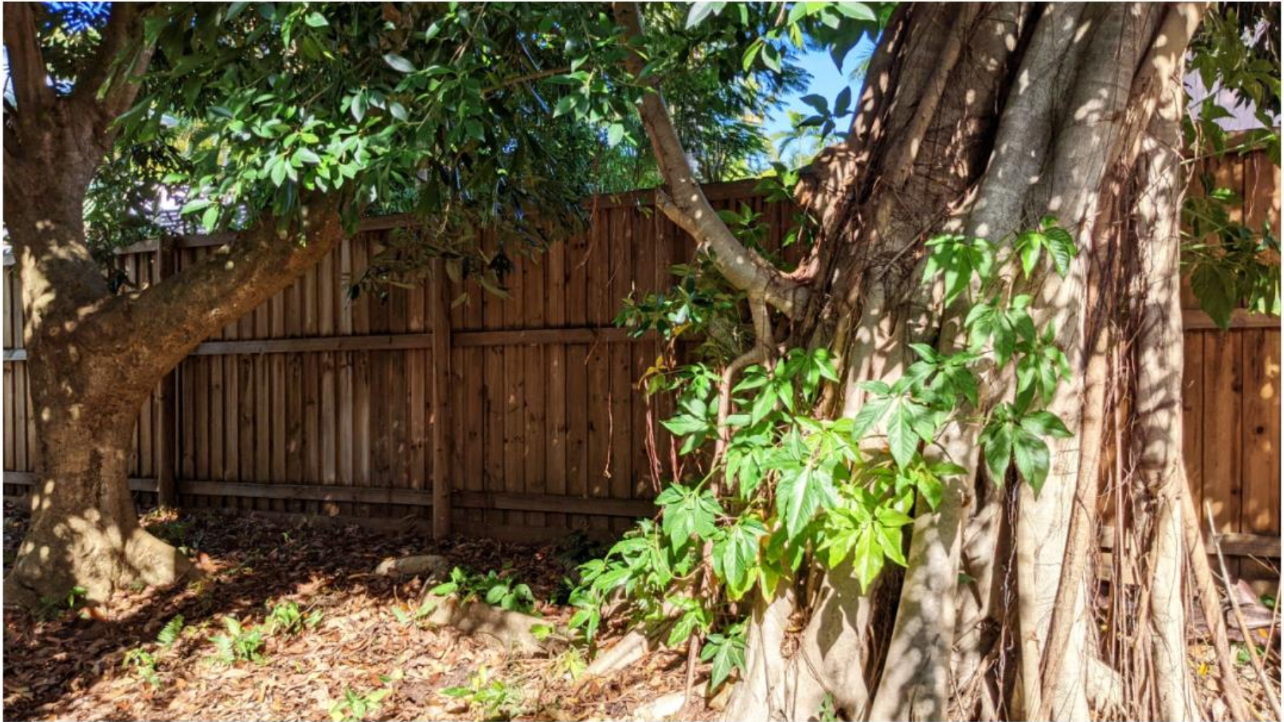
Lychee (left), strangler fig (right) and back fence