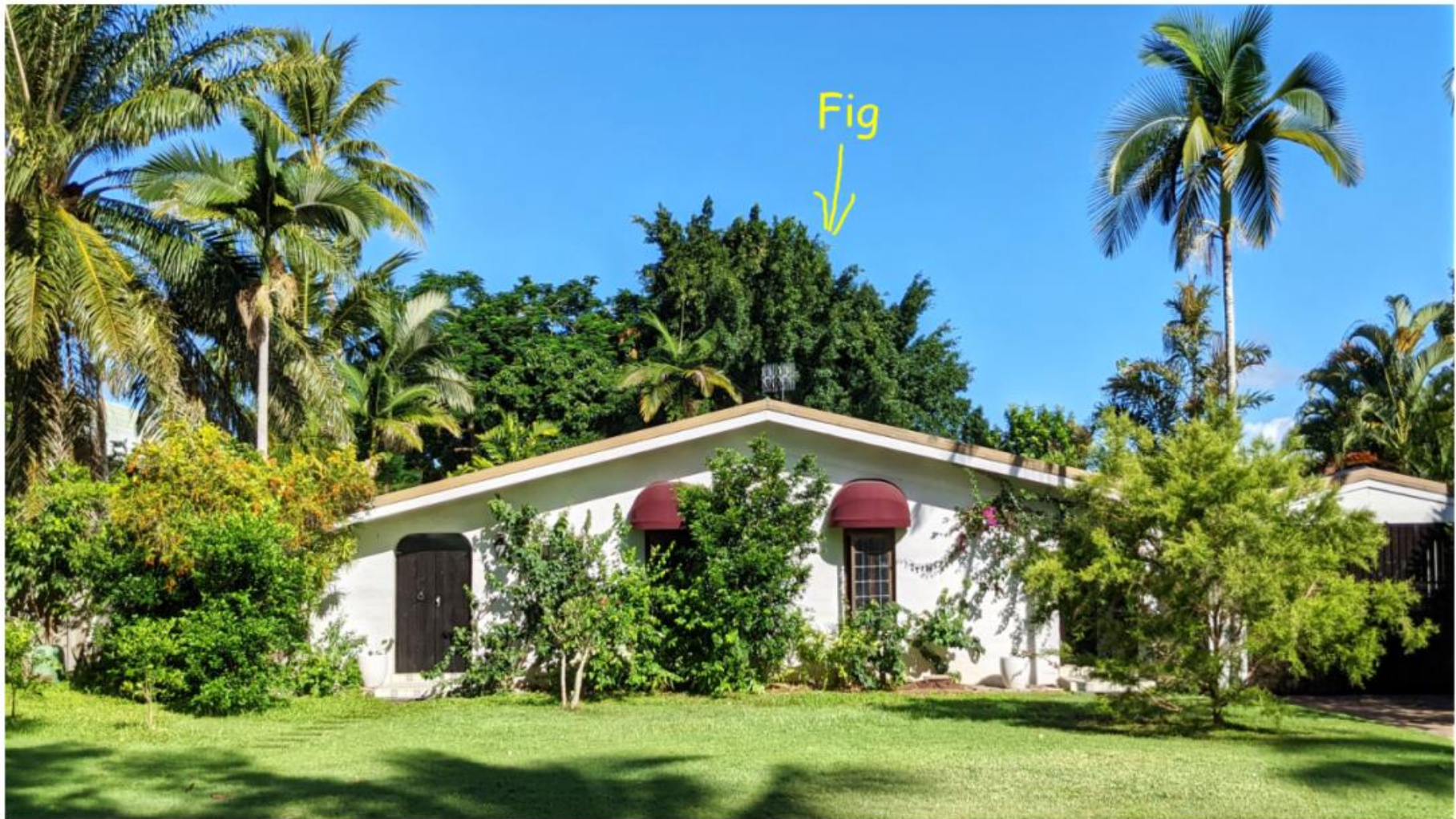
View from Nautilus Street