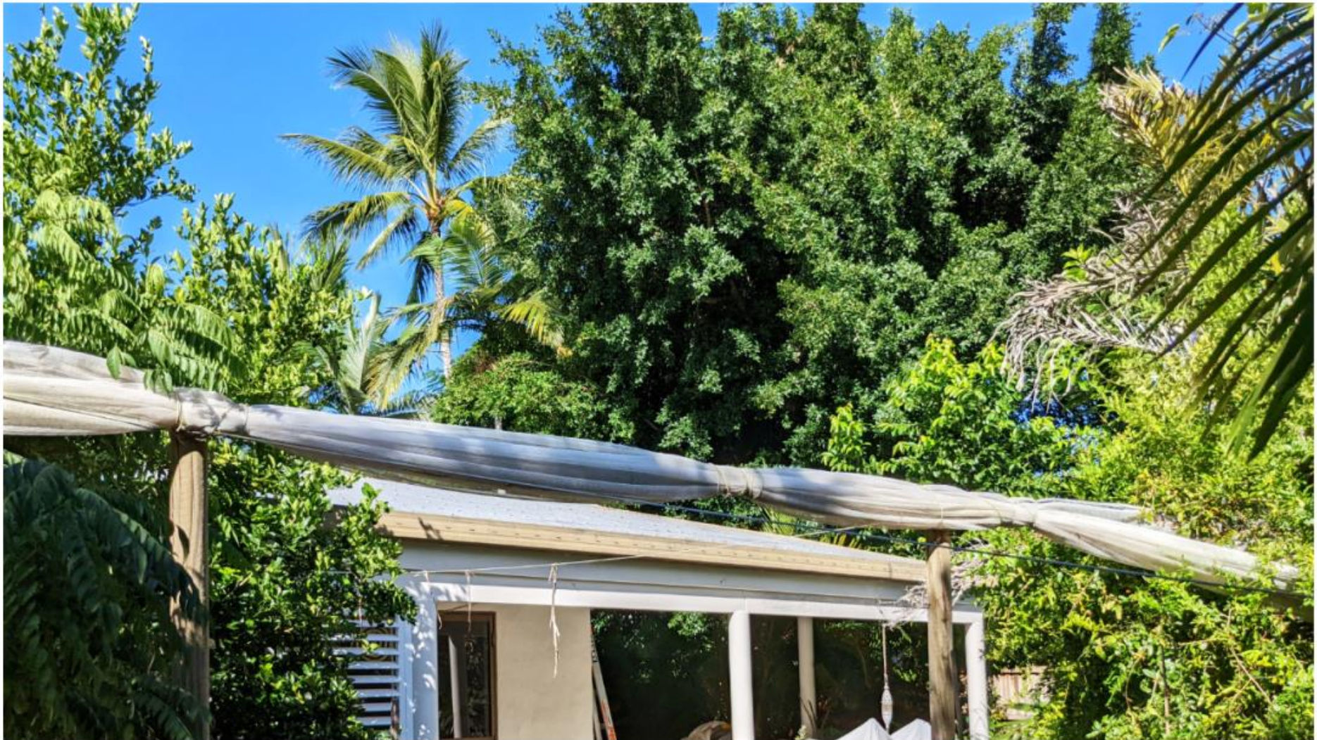
View from vegetable garden