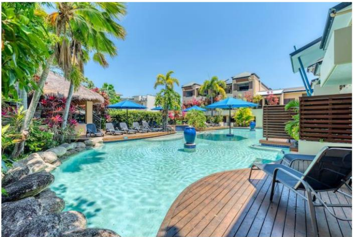
Photograph 7: Communal recreational facilities