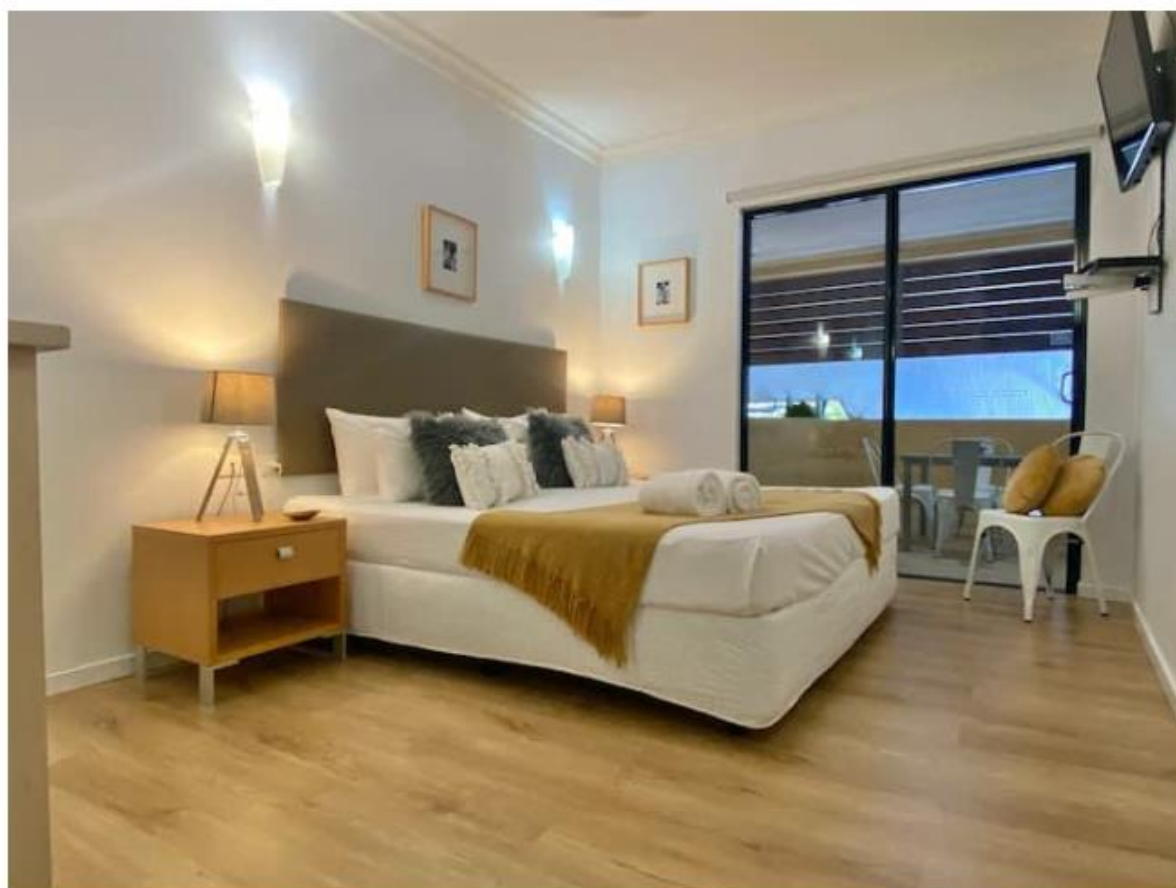
Photograph 2: Main bedroom through to balcony