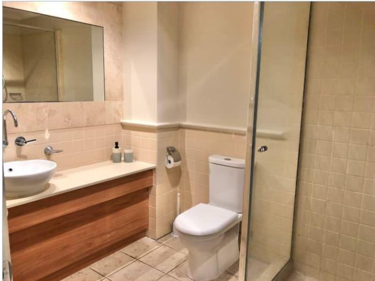
Photograph 6: Bathroom facilities