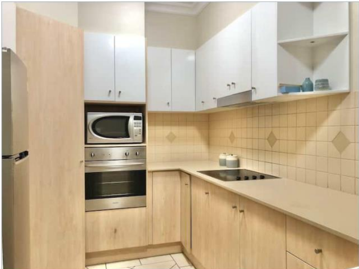
Photograph 4: Kitchen