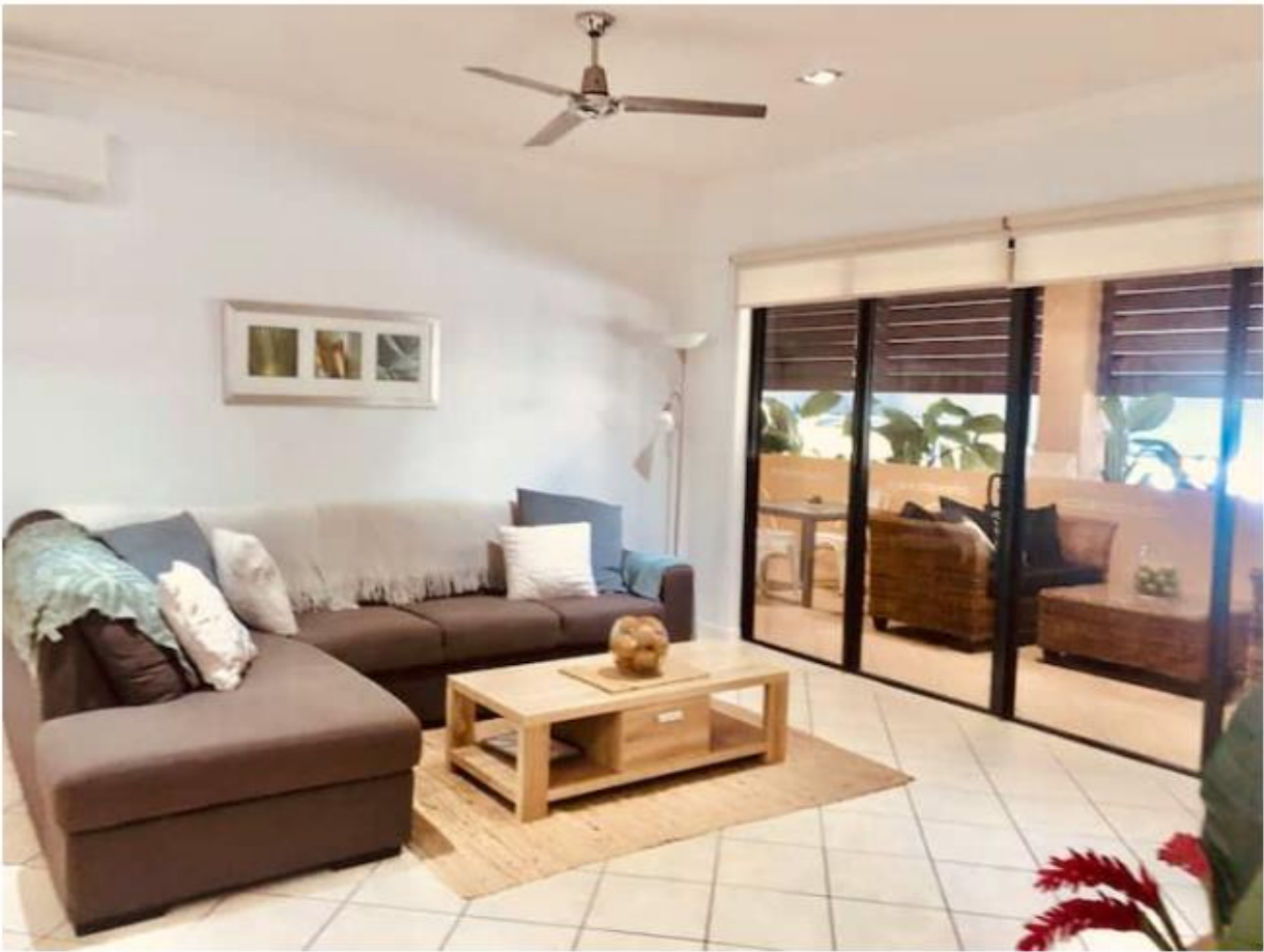
Photograph 3: Living area