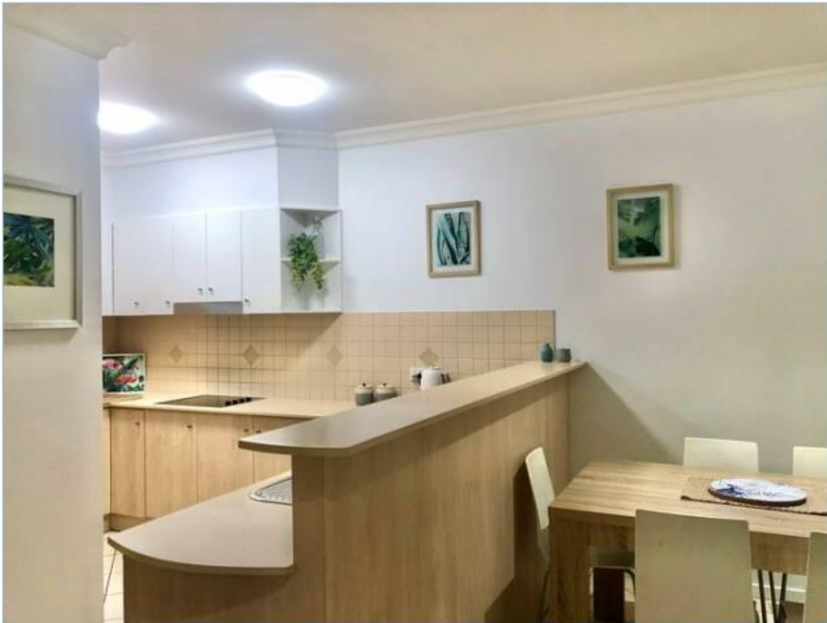
Photograph 5: Kitchen and dining area