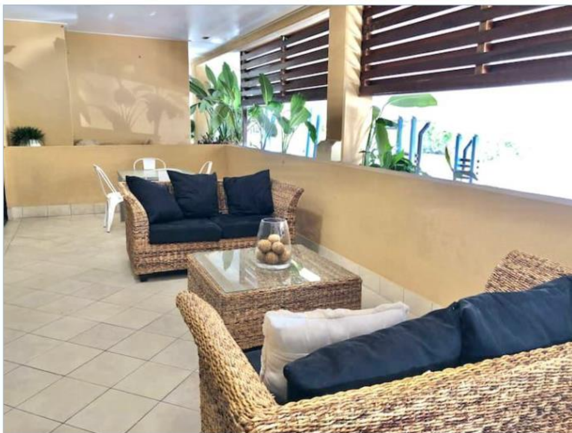
Photograph 1: View from private balcony across Warner Street