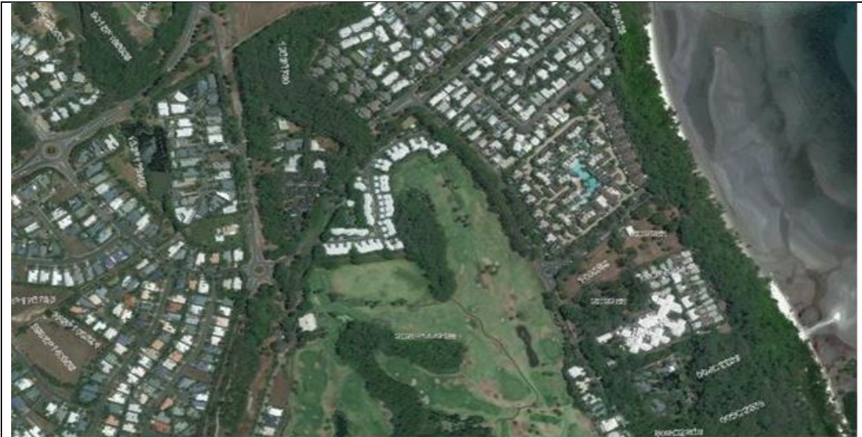
LOCALITY PLAN – PARADISE LINKS