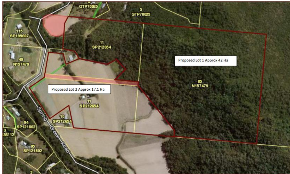
Proposed Plan of Subdivision (Boundary Realignment)

Approved Drawing (s) and / or Document(s) – Generally as below and to be amended subject to the Conditions of the Approval.