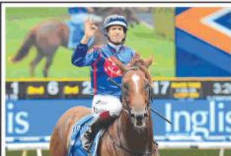
High Bloodline on Profbeer returns to action after winning the Inglis Millionaire.

For a start, the most degree of title to the Queensland economy.