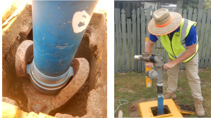
Image of standpipe on base, between the locating hooks and turning standpipe clockwise