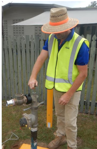
Image of turning the Tee Top clockwise to allow water extraction