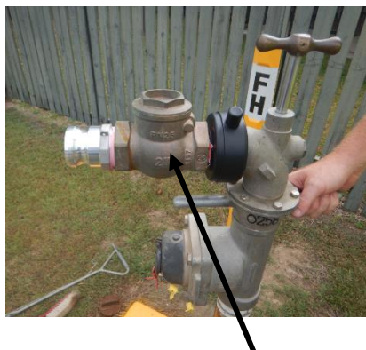
Image of back flow device