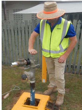
Image of turning Tee Top anticlockwise