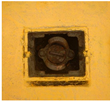
Image of a hydrant plug