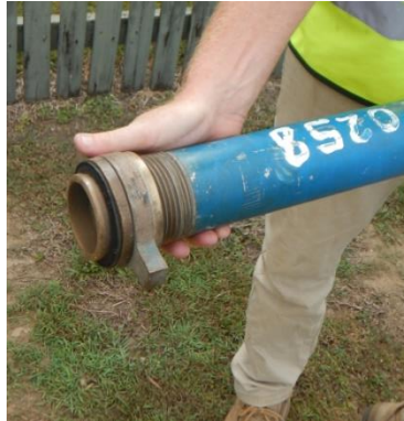
Image of lug nut