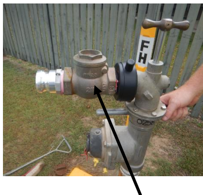
Image of back flow device