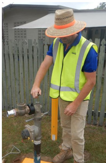
Image of turning the Tee Top clockwise to allow water extraction