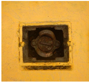
Image of a hydrant plug