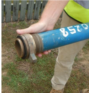
Image of lug nut