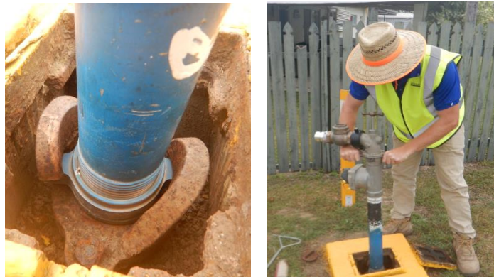
Image of standpipe on base, between the locating hooks and turning standpipe clockwise