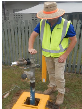
Image of turning Tee Top anticlockwise